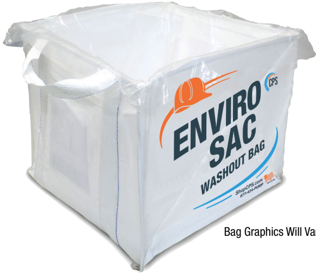
Bag Graphics Will Vary