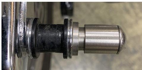
With Detachable backrest hardware

Replace the bolts in your strut with the new bolts one at a time, using blue thread locker. If you have the nut plate with both holes threaded, you can use it instead of the nuts provided (they are crimped jam nuts and may be difficult to start). Make sure the ends of the bolts stick out no more than \frac{1}{8} " past the nut, or they may rub on the tire.