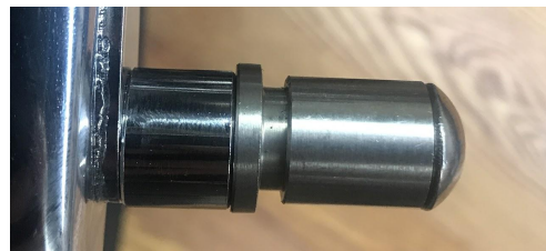
With 1/2" chrome spacer