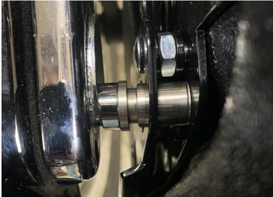
INCORRECT Brackets are not on the docking points and will not clamp on in this position

Once all 4 bolts have been tightened, you can mount the bags. With the handle pulled up, slide the bags on to the docking points, making sure the bracket sits in the grooves on the docking points (refer to pictures below). Push down the lever on the bag and you should feel it snap into place with about 20 pounds of force. If it is too difficult or too easy to push the handle down, the brackets may require adjustment (see next section). To remove the bags, lift up on the handle while holding up the spring loaded latch. The lock on the inside of the bag lets you lock the bags to the bike for theft prevention.