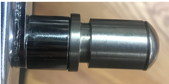
Stud mounted with ½" spacer

Replace the bolts in your strut with the new bolts one at a time, using blue thread locker. If there is a narrow plate behind your fender with an unthreaded hole at the rear, remove it and use the included nuts to attach the bolts (they are crimped jam nuts and may be difficult to start). If you have the nut plate with both holes threaded, you can use it instead of the nuts provided. In either case use thread locker to ensure they don't vibrate loose. Make sure the ends of the bolts stick out no more than ⅛" past the nut, or they may rub on the tire.