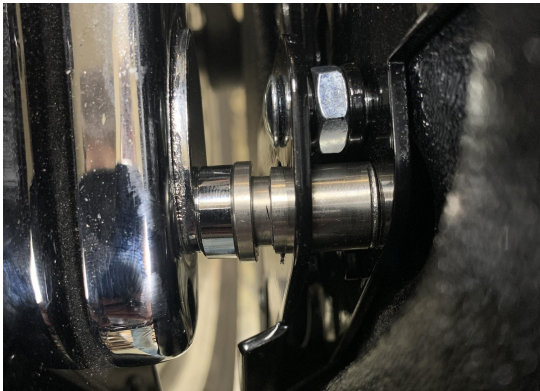
INCORRECT Brackets are not on the docking points and will not clamp on in this position

Once all 4 bolts have been tightened, you can mount the bags. With the handle pulled up, slide the bags on to the docking points, making sure the bracket sits in the grooves on the docking points (refer to pictures below). Push down the lever on the bag and you should feel it snap into place with about 20 pounds of force. If it is too difficult or too easy to push the handle down, the brackets may require adjustment (see next section). To remove the bags, lift up on the handle while holding up the spring loaded latch. The lock on the inside of the bag lets you lock the bags to the bike for theft prevention.