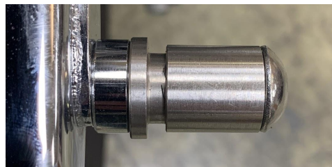
With \frac{1}{4} " chrome spacer