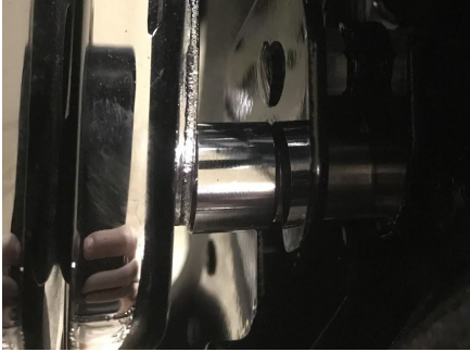
CORRECT mounting, brackets are butted up against chrome spacers and completely cover docking points

Once all 4 bolts have been tightened, you can mount the bags. With the handle pulled up, slide the bags on to the docking points on your bike, making sure to completely cover the \frac{3}{4} " spacers (refer to pictures below). Push down the lever on the bag and you should feel it snap into place with about 25 pounds of force. If it is too difficult or too easy to push the handle down, the brackets may require adjustment (see below). Then turn the lock to the vertical position. Do not ride without the lock engaged. To remove the bags, turn the lock horizontal, lift up on the handle, and slide them off of the docking points.