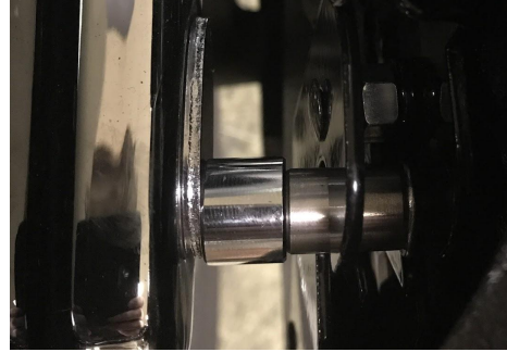
INCORRECT mounting, bracket is only halfway on to the docking points, not butted up to chrome spacer