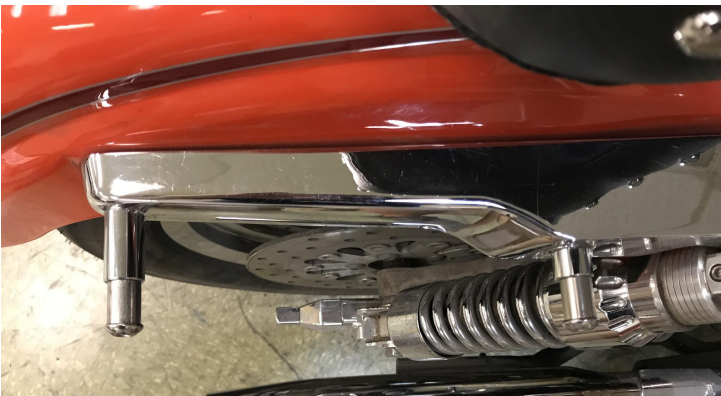
Correct mounting of docking points.

Next, replace the bolts on your bike one at a time so the fender doesn't drop. The 3 ¼" bolts go in the front and the 2 ¾" bolts go in the rear holes of the strut. Use blue loctite on the threads when attaching the new bolts.