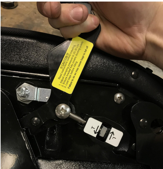
Move lever rearward (right in this picture) to make adjustments

The brackets will require adjustment when they come from the factory. The brackets with also require periodic adjustment for the life of the bags as they break in. To adjust the bracket: with the lever pulled up, slide the handle rearward on the bracket. This allows the square nut to be turned, adjusting the clamping pressure. Follow the markings on the bag, T to tighten and L to loosen. Once adjusted, move the lever forward again and test mount the bags. It should take 25-30 Lbs of pressure to clamp the bags in place.