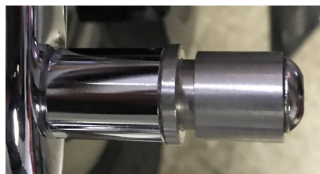
Correct stud mounting for rear strut holes for all model years, and front holes on '93-'03 bikes