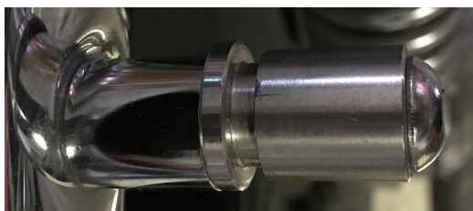
Correct stud mounting for front strut holes on '04 and newer models

Mount the docking points to your strut, replacing your bolts, one at a time so that you don't drop the fender. For '04 and newer models on the front holes, put a docking point onto the bolt, followed by a 3/4" spacer, then mount to the bike. For '93-'03 models, you will use a 1" spacer instead of a 3/4" spacer in the front. All model years will use a 1" spacer in the rear. Use blue loctite on all threads. We have supplied some thin locking nuts if you want to use them instead of the stock ones.