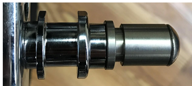
Stud mounted with Harley Holdfast hardware