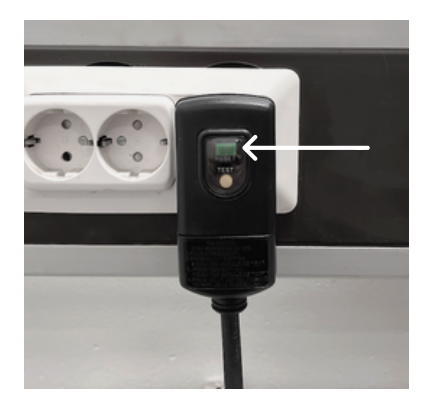
Once the pool is filled, plug it in and turn on the power by pushing the green button in the plug.