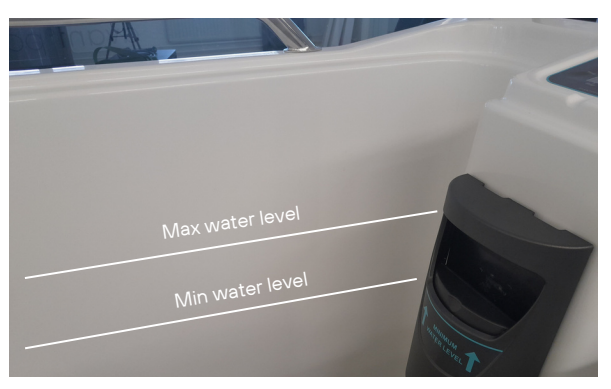
The minimum level of the water must be above the minimum lever sticker of the filter cover. The maximum level is about 13 cm below pools top level.