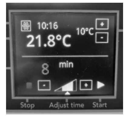
Set the target temperature. In upper left corner of the touch screen, you can see the current temperature of the water and on the right corner the target temperature.