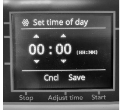
Set the existing time of the day.