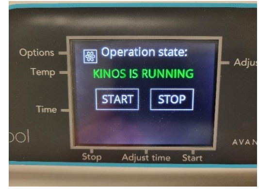
Fig. 4a Fig. 4b

• In upper left corner of the touch screen, you can see the current temperature of the water and on the right corner the target temperature. The default target is set to 10°C. (Fig. 5)