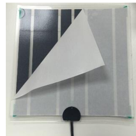
Self – Adhesive