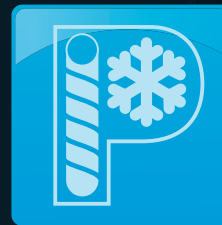
Heat Mat PipeGuard