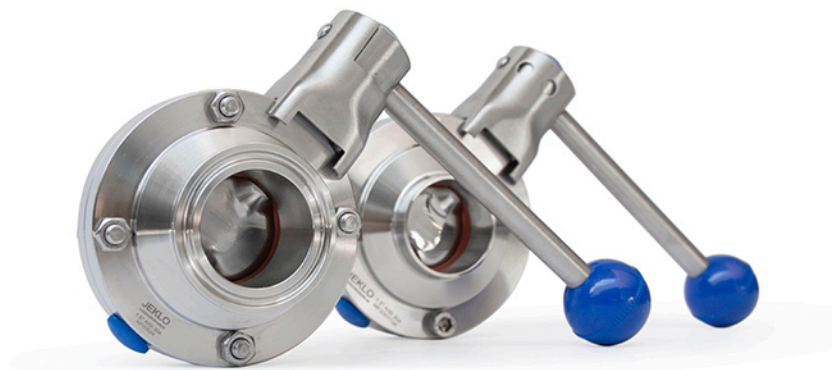
Butterfly valve clamp and weld end connection, with three point pull handle