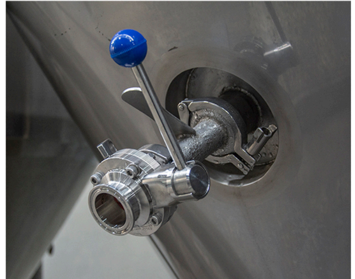
Butterfly valve clamp connection, with three point pull handle