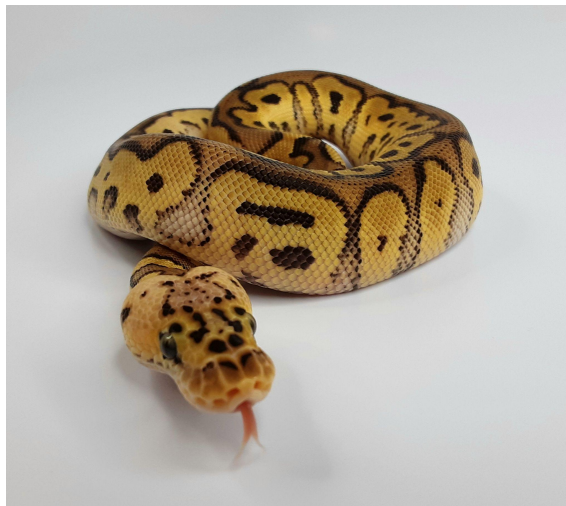
(Pastel Clown Ball Python)

Ball pythons are among the most popular pet snakes. They are good beginner snakes because they are docile and easy to care for. Housing for a ball python can vary from simple to elaborate. We keep all of our snakes in rack systems. However, glass aquariums or vision cages work well too. The most important thing is that you follow several rules and check in on your pet often to ensure it appears to look and act healthy.