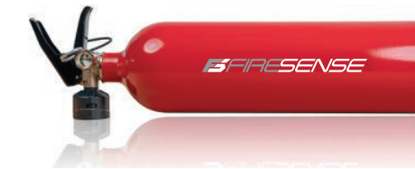
FIRESENSE - AR-AFFF