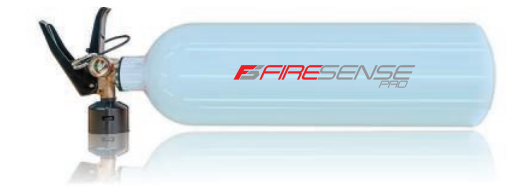
FIRESENSE PRO - 4F UNIVERSAL