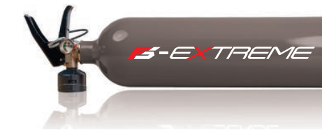
FIRESENSE EXTREME - NOVEC