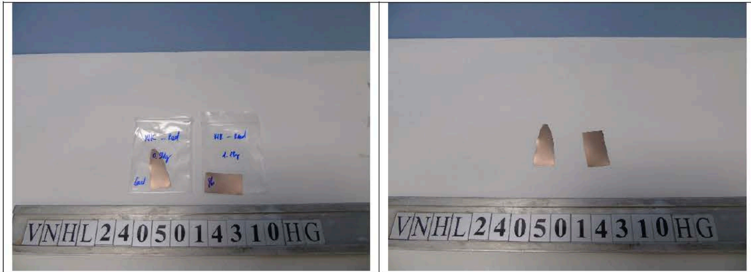
PHOTO OF SUBMITTED SAMPLE FOR TESTING

REPORT RESULTS REFER TO SUBMITTED SAMPLE(S) ONLY *** End of Report ***