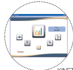
KINETEC DATA CAPTURE™