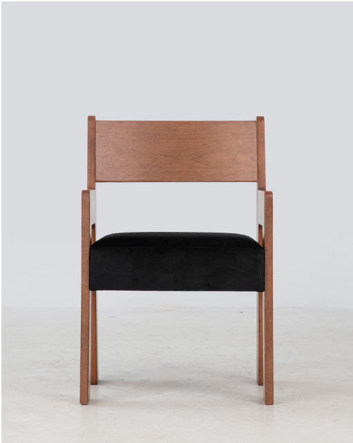
Amber Wood + Black Velvet