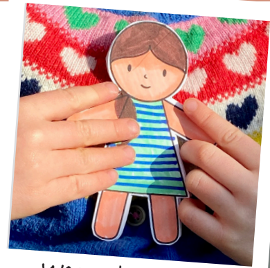
We made one here!