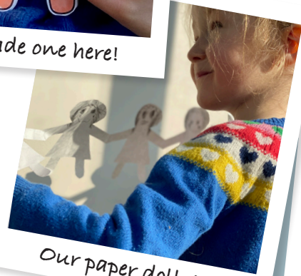
Our paper dolls!

Next print template at 50% then trace half the doll onto your folded paper and ask a grown up to help you cut it out.