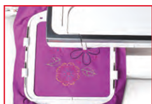
Patented Robotic Drive Precision Embroidery