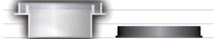
RAIN BIRD WIPER SEAL