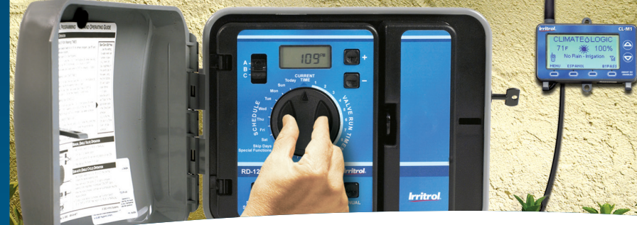
SMRT LOGIC® RAINSENSOR™