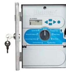
Stainless Steel Height: 25 cm Width: 19 cm Depth: 11 cm