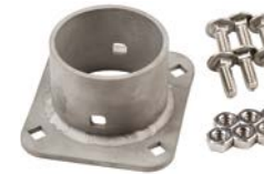
XCHSPB Mounting bracket and hardware only (optional)