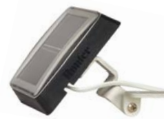
SPXCH Solar Panel Kit (optional) Height: 8 cm Length: 25 cm Width: 8 cm