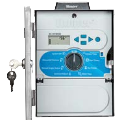
Stainless Steel Solar Height: 27 cm Width: 19 cm Depth: 11 cm