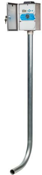
XCHSPOLE Pole-Mounting Kit (optional) Height: 1.2 m