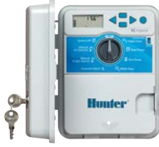
Plastic Height: 22 cm Width: 18 cm Depth: 10 cm