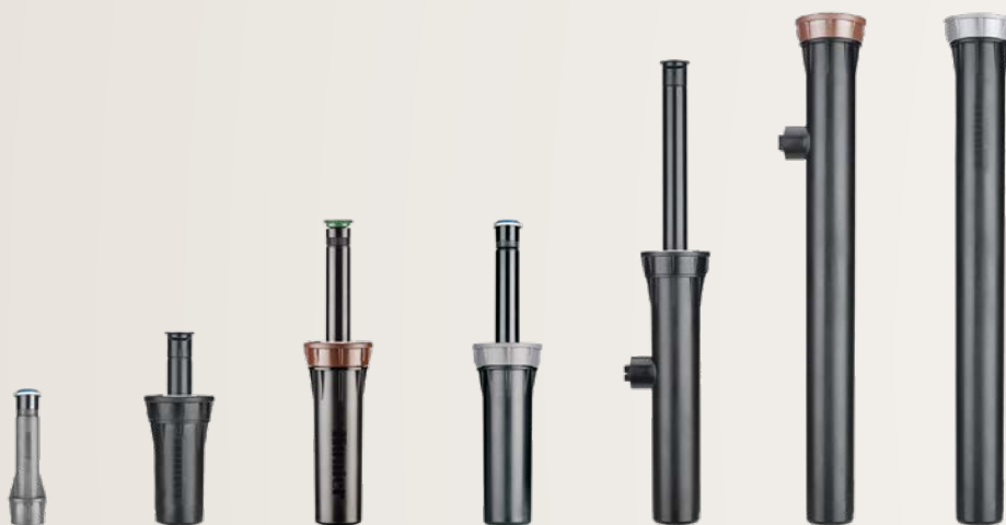
Shown here: PRS40 shrub, Pro-Spray 5 cm, PRS30 and PRS40 10 cm, Pro-Spray 15 cm, and PRS30 and PRS40 30 cm sprays

All models also include a user-friendly pull-ring flush cap to keep debris and clogging to a minimum. The Hunter Pro-Spray sprinkler head is compatible with all industry standard female nozzles offering a high degree of flexibility.