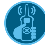
ROAM Remote ROAM XL Remote