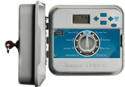
Plastic Outdoor Height: 22.9 cm Width: 25.4 cm Depth: 11.4 cm