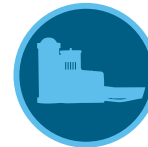
Solar Sync Sensor