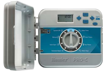
Plastic Indoor Height: 22.9 cm Width: 25.4 cm Depth: 11.4 cm