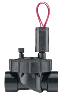
PGV-100JT-G Inlet diameter: 1" (25 mm) Height: 14 cm Length: 11 cm Width: 8 cm