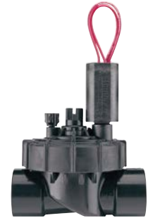
PGV-101JT-G Inlet diameter: 1" (25 mm) Height: 14 cm Length: 11 cm Width: 8 cm