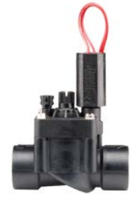
PGV-101G Inlet diameter: 1" (25 mm) Height: 13 cm Length: 11 cm Width: 6 cm