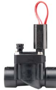
PGV-100G Inlet diameter: 1" (25 mm) Height: 13 cm Length: 11 cm Width: 6 cm