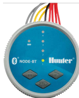
NODE-BT Diameter: 8.9 cm Height: 8.3 cm

The Bluetooth® word mark and logos are registered trademarks owned by Bluetooth SIG Inc. and any use of such marks by Hunter Industries is under license. iOS is a trademark or registered trademark of Cisco in the U.S. and other countries and is used under license. Android is a trademark of Google LLC.