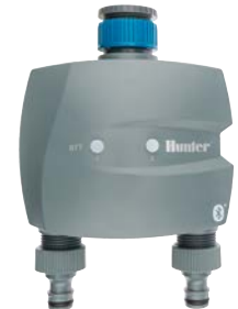
BTT-201 Inlet diameter: 3/4" and 1" Outlet diameter: 3/4" Height: 15.7 cm Width: 13.5 cm Depth: 7.6 cm