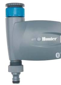
BTT-101 Inlet diameter: 3/4" and 1" Outlet diameter: 3/4" Height: 16.8 cm Width: 12 cm Depth: 6 cm

The Bluetooth® word mark and logos are registered trademarks owned by Bluetooth SIG Inc. and any use of such marks by Hunter Industries is under licence. iOS is a trademark or registered trademark of Cisco in the U.S. and other countries and is used under licence. Android is a trademark of Google LLC.