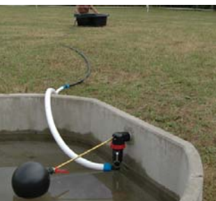
Connect to portable breakfeed trough

1kPa = 0.145psi = 0.01 bar 1 L/min. = 0.22 Imperial gpm