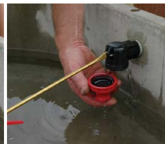
Service without removing arm