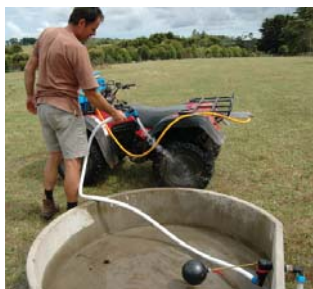
Wash down equipment