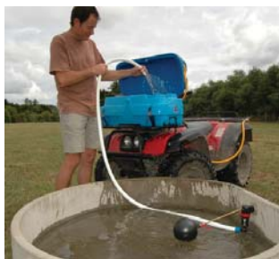
Filling spray tank