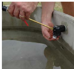
No tools required to service