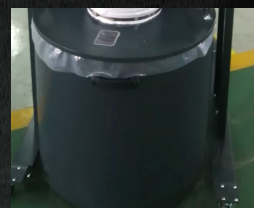
174L Large Capacity Dust Bin with Bag Supplied for Easy Dust Collection