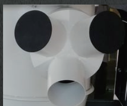
Triple Dust Suction Ports Design for Multiple Equipment Using