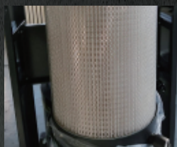
Miron Level High Efficient Filter with Self-clean Function