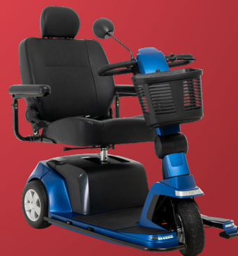
3W — FDA Class II Medical Device 1