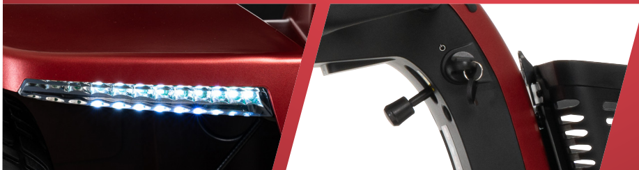
Full LED light package