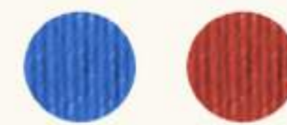
ESTILO CROSSBODY BAG