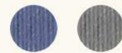
MONEDA COIN POCKET WALLET