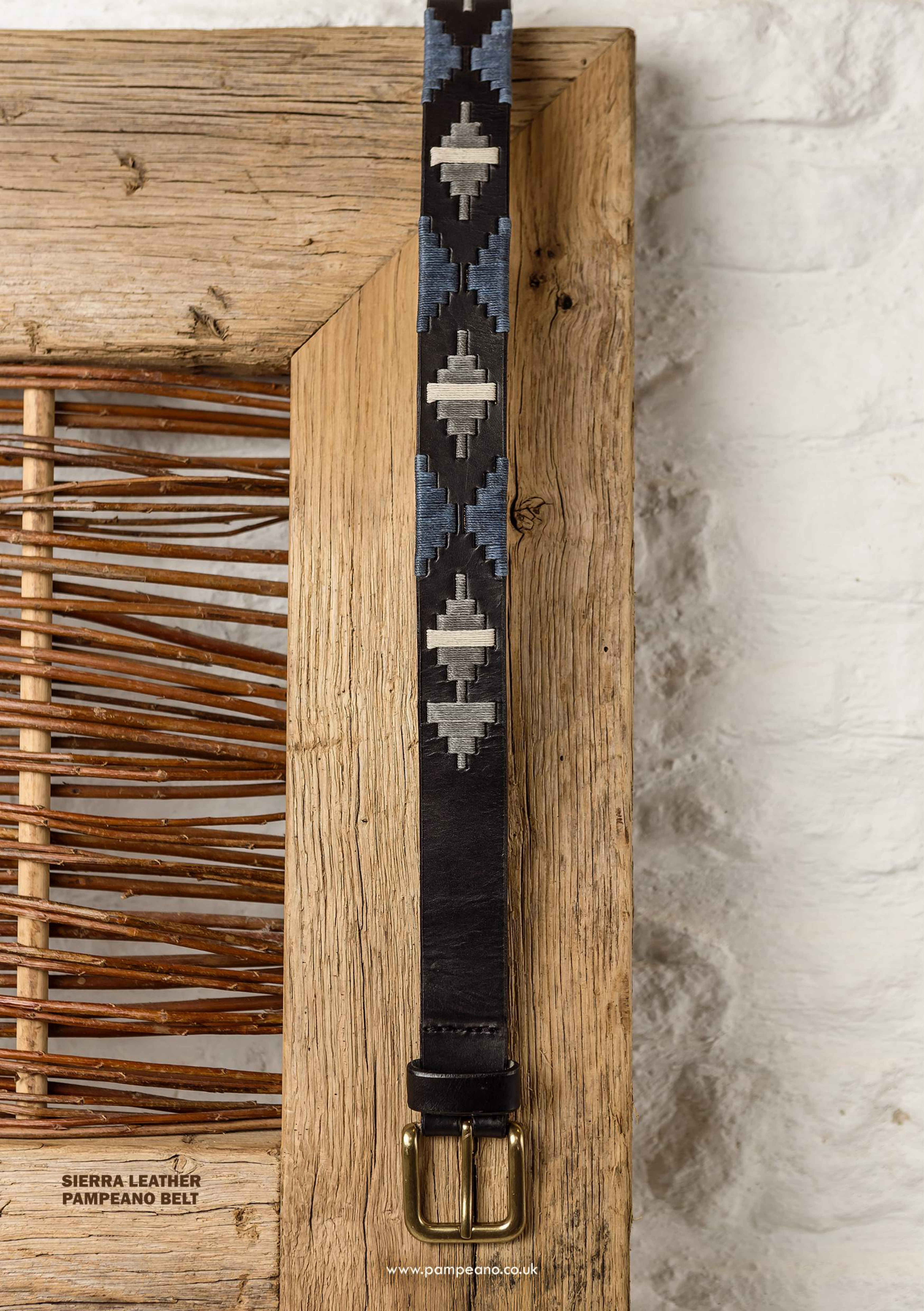
SIERRA LEATHER PAMPEANO BELT