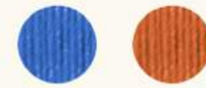
CABALLERO LARGE TRAVEL BAG