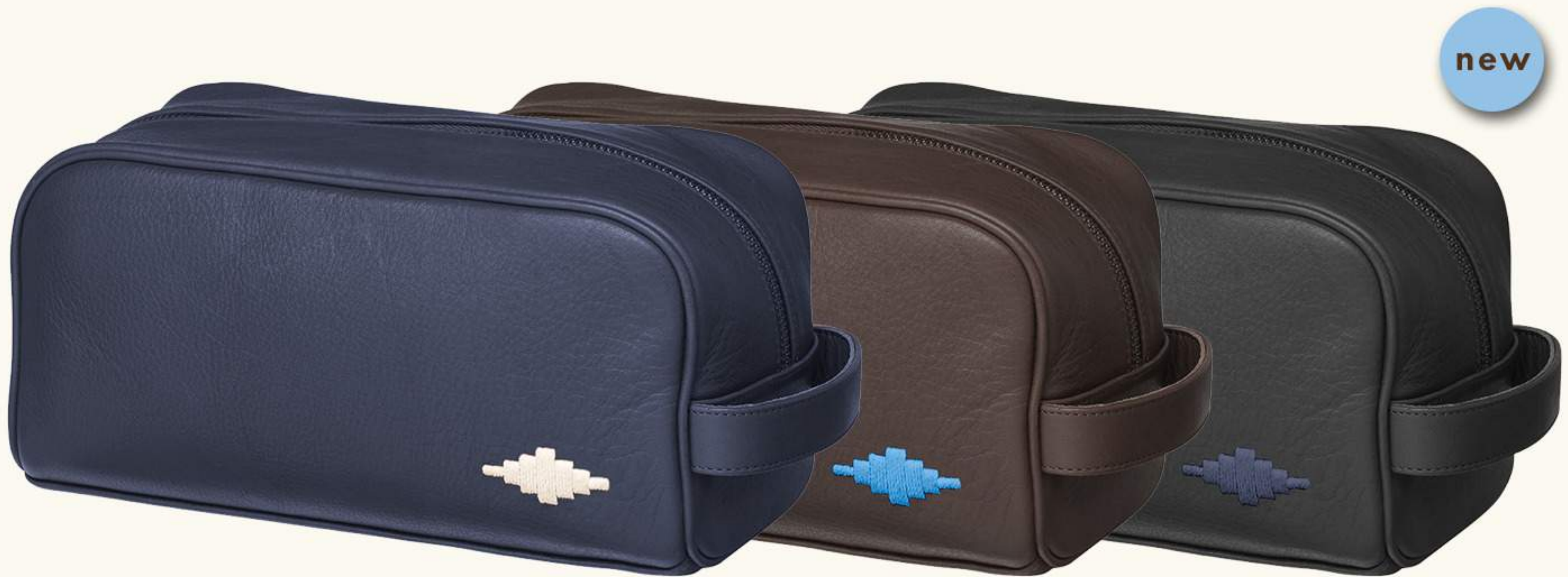
HOMBRE WASHBAG WITH HANDLE