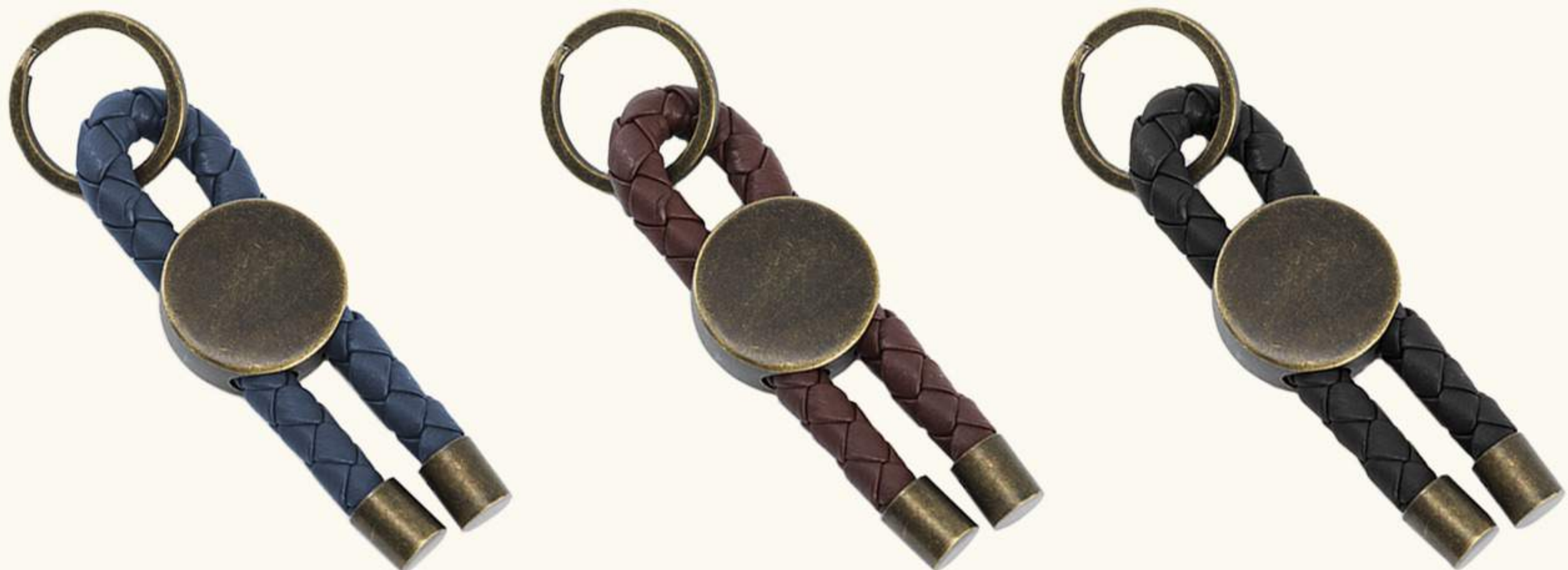
CUERDA ROPE KEYRING