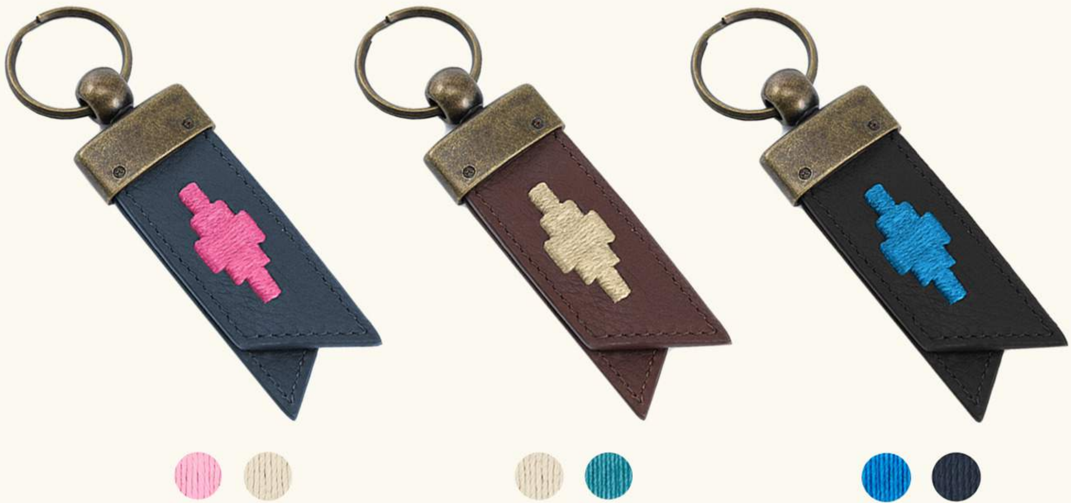
JUNTOS ORIGAMI KEYRING