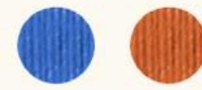
VARON SMALL TRAVEL BAG