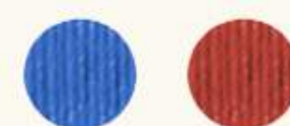
TRAPECIO TOTE BAG