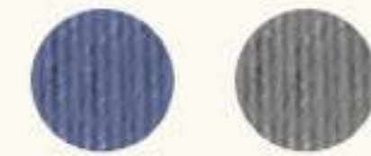
DINERO CARD WALLET