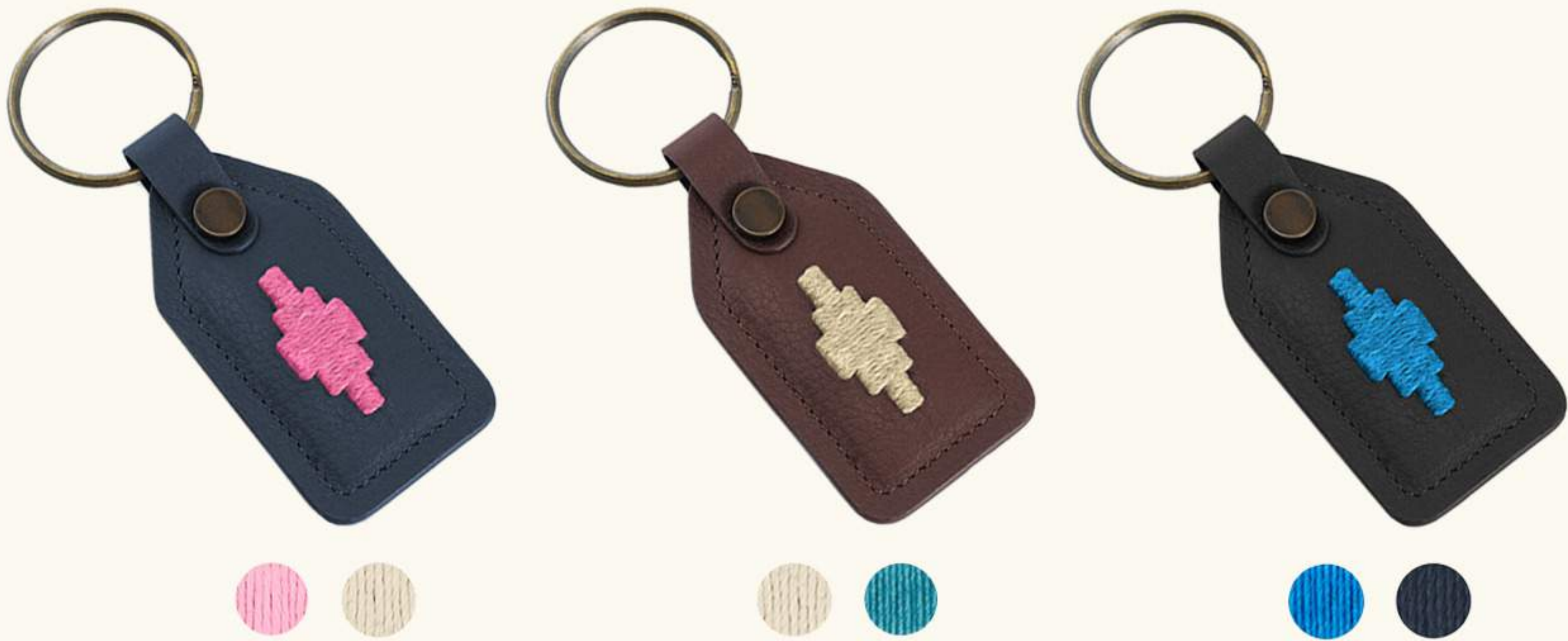
CHAPA TAG KEYRING