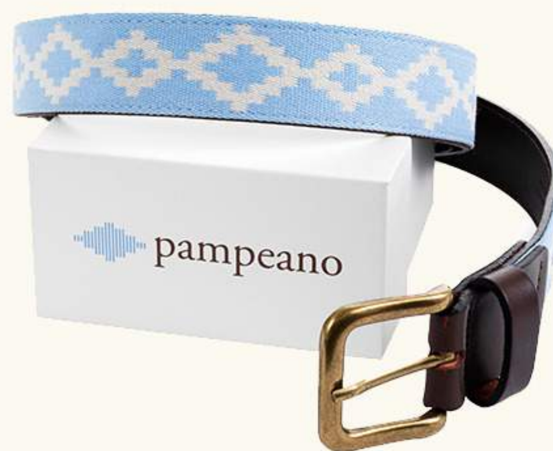
LIGHT BLUE CINCHA