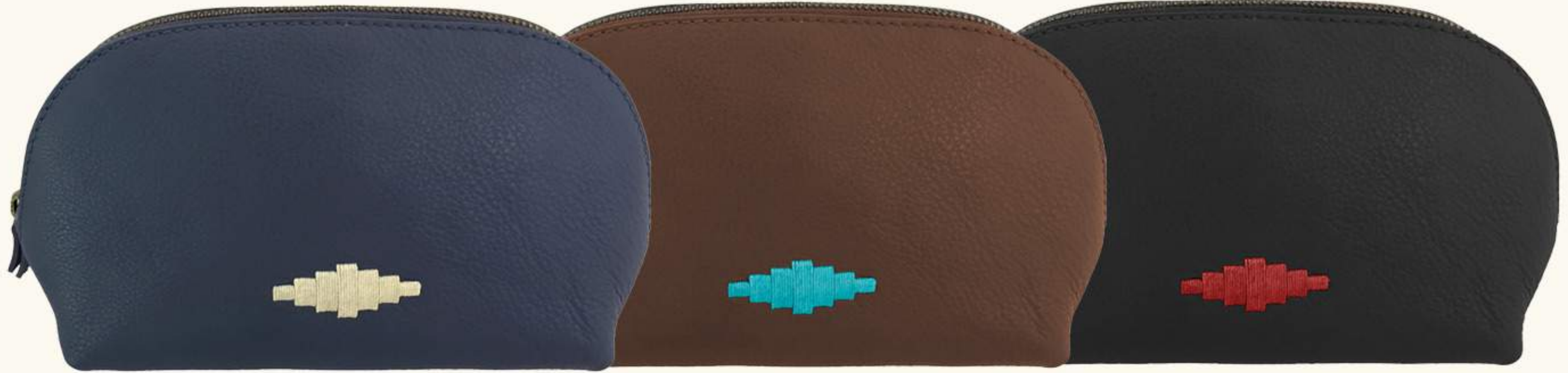
BRILLO SMALL WASHBAG