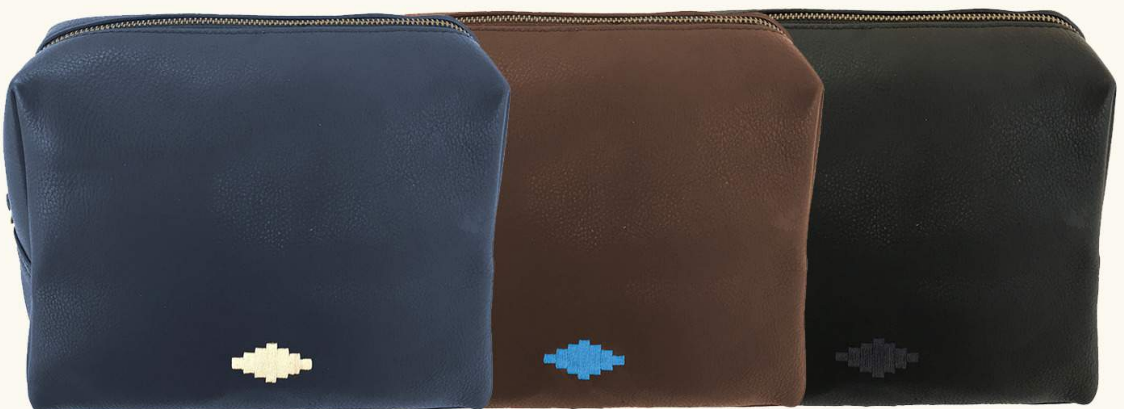
AFEITE LARGE WASHBAG