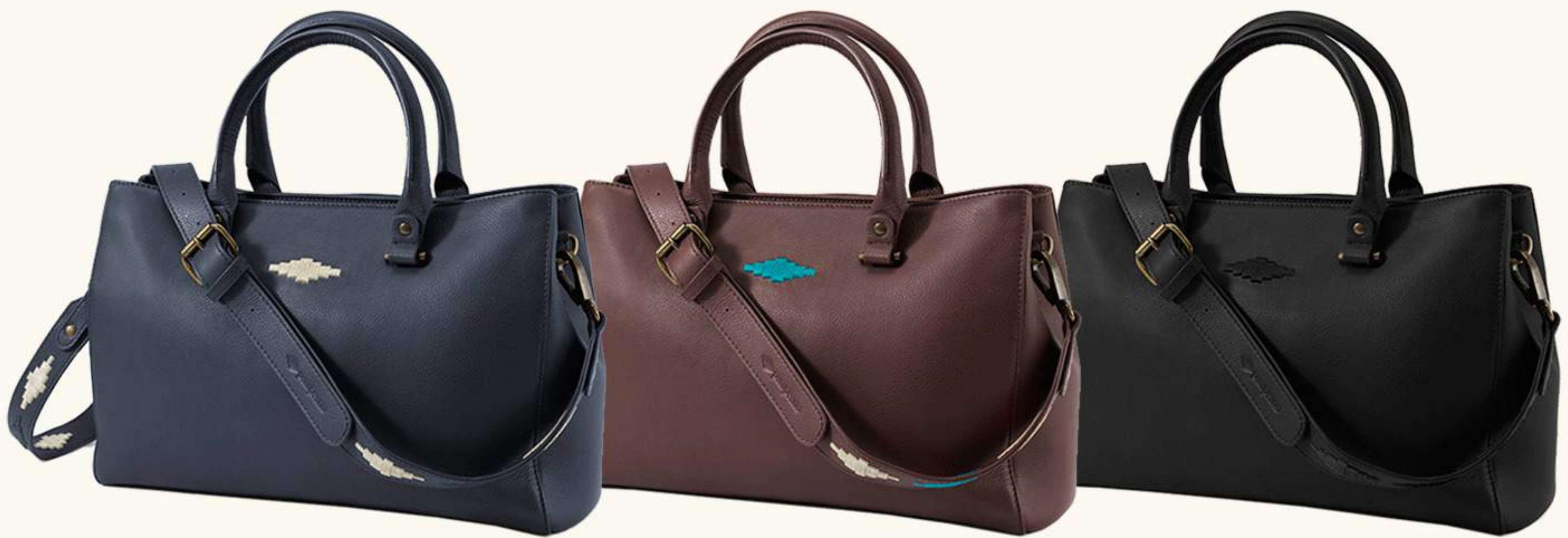
DIVERSA SACHEL BAG