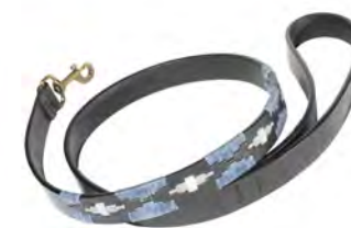
Diamonds & Tabs