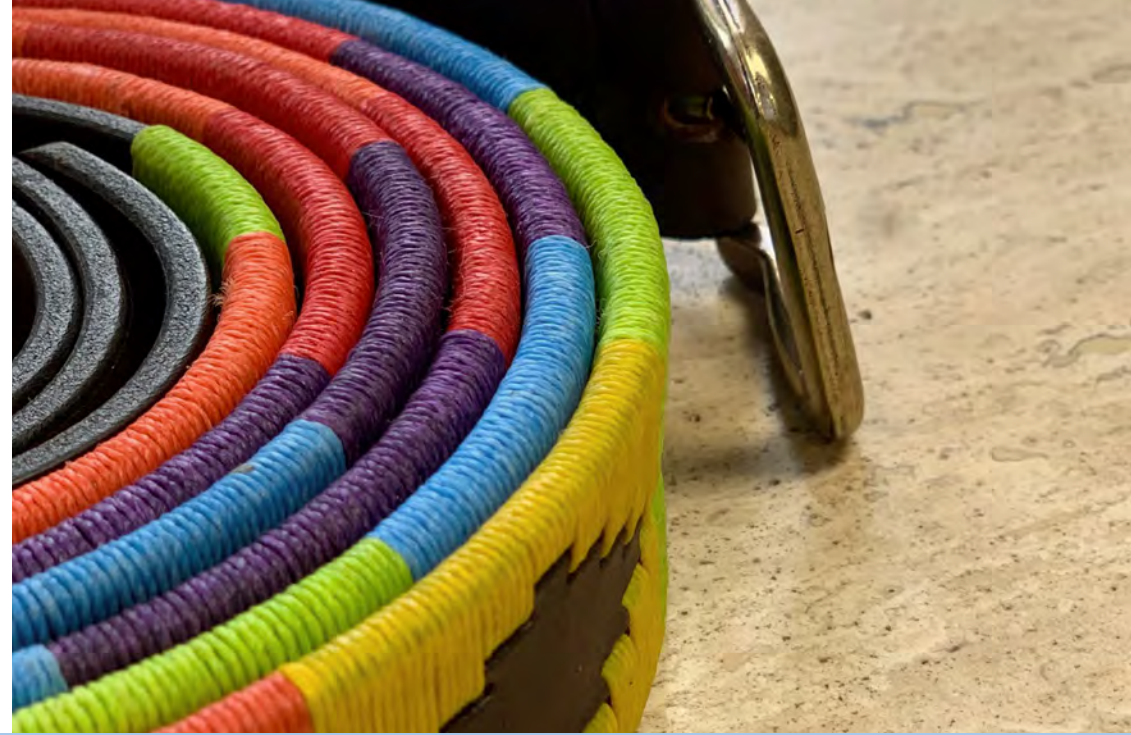
colour block combinations