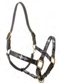
Diamonds & Tabs