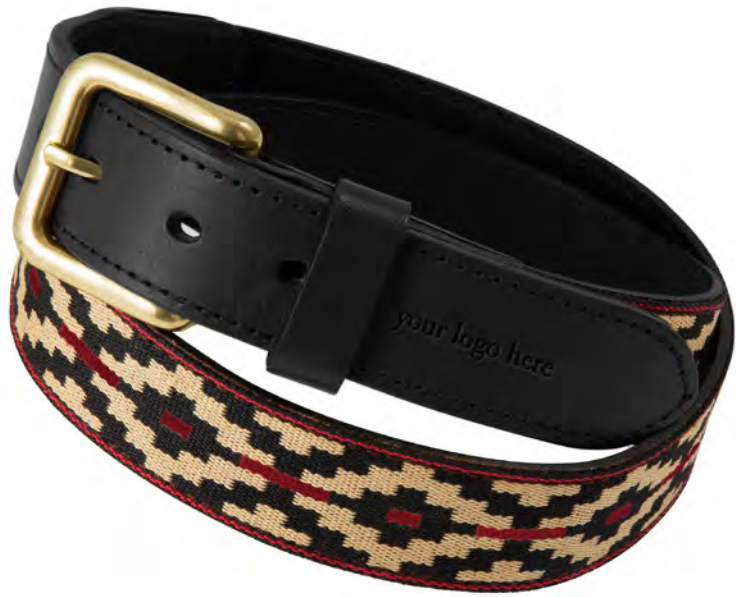
fabric ribbon on leather belts