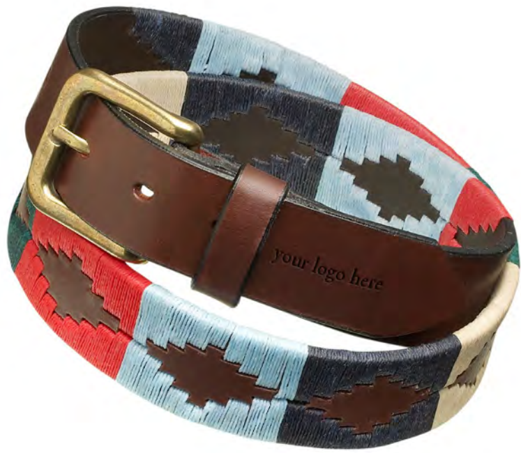
classic woven belts