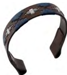
Diamonds & Tabs