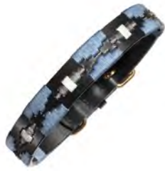
Diamonds & Tabs