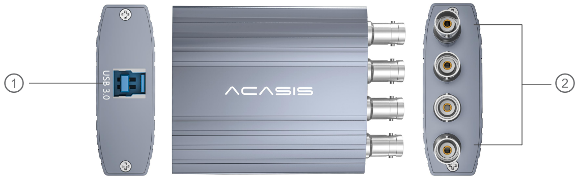
① USB3.0 Output interface ② AHD Input interface