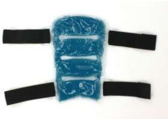
TheraPearl Shin Wrap with Tapered Baffles