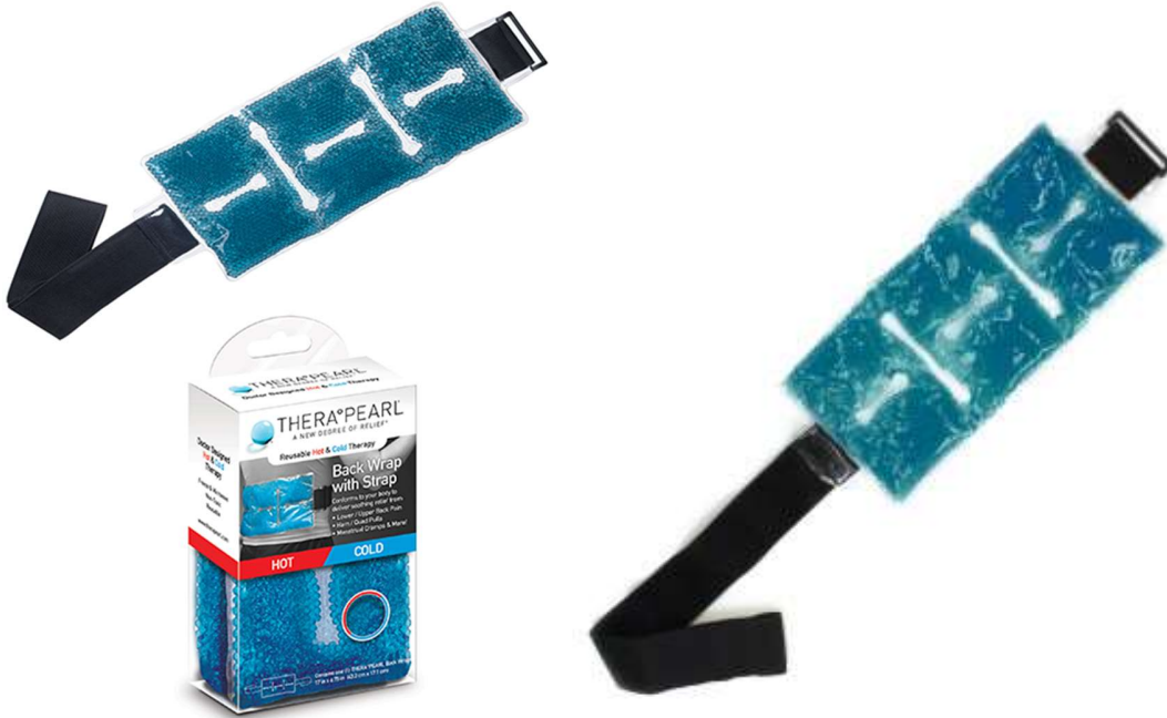
TheraPearl Back Wrap with Tapered Baffles