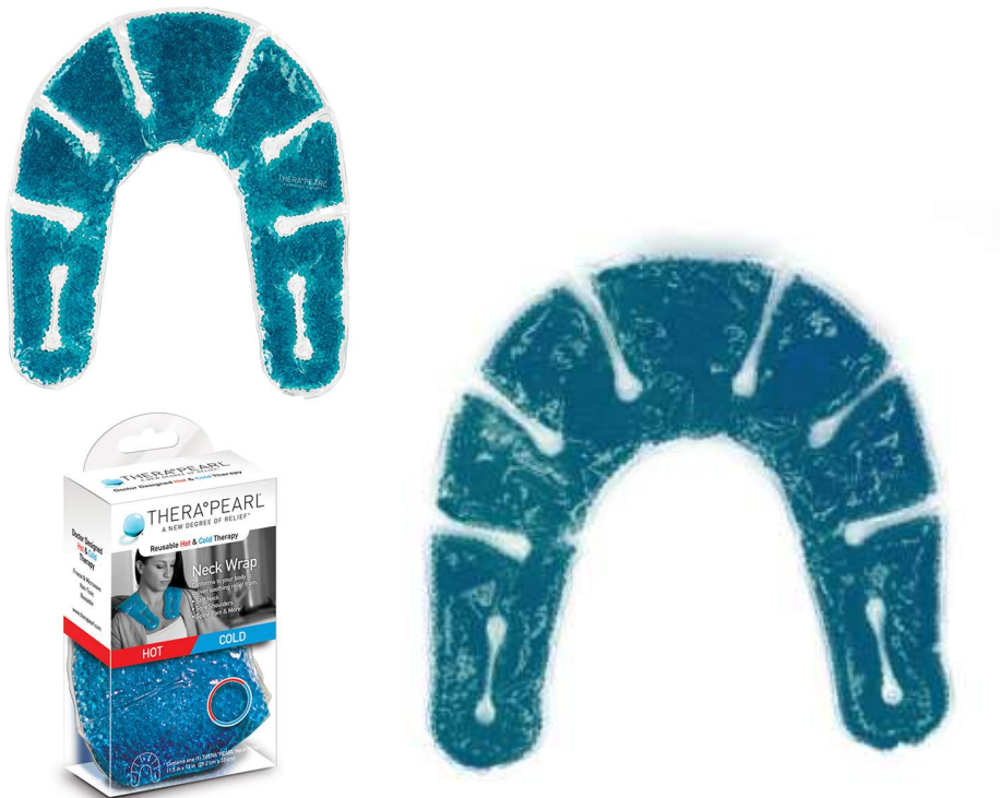
TheraPearl Neck Wrap with Tapered Baffles