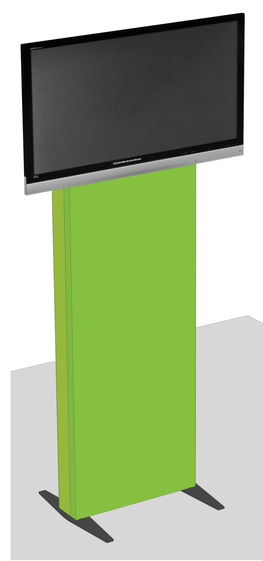
panoramic® C-line PM04-70 A