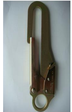
Table 1: Grid Hook - Gold Dimensions

The Grid Hook – Gold is made of SAE 4130 Grade Alloy Steel. This material is chromium-molybdenum steel with 1% molybdenum/chromium by mass with an included 0.30% carbon. 4130 Alloy steel is low-alloy steel that has good strength, toughness, as well as good atmospheric corrosion resistance.