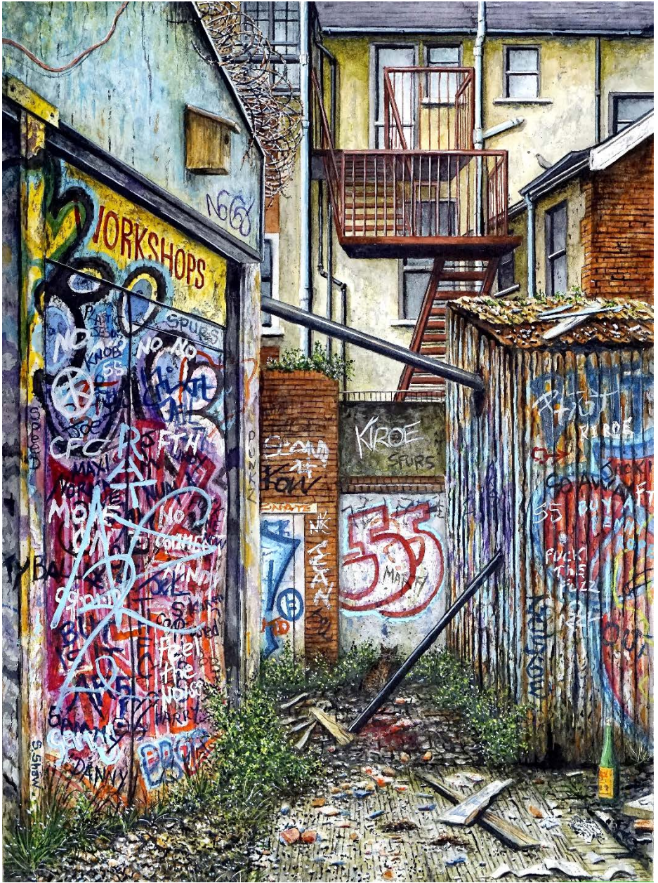
In the Jungle , Watercolour on Paper, 38 x 28 cms