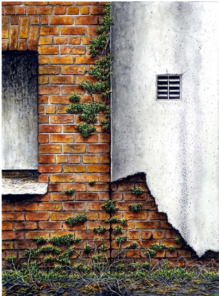
Split 2 , Watercolour on Paper, 38 x 28 cms