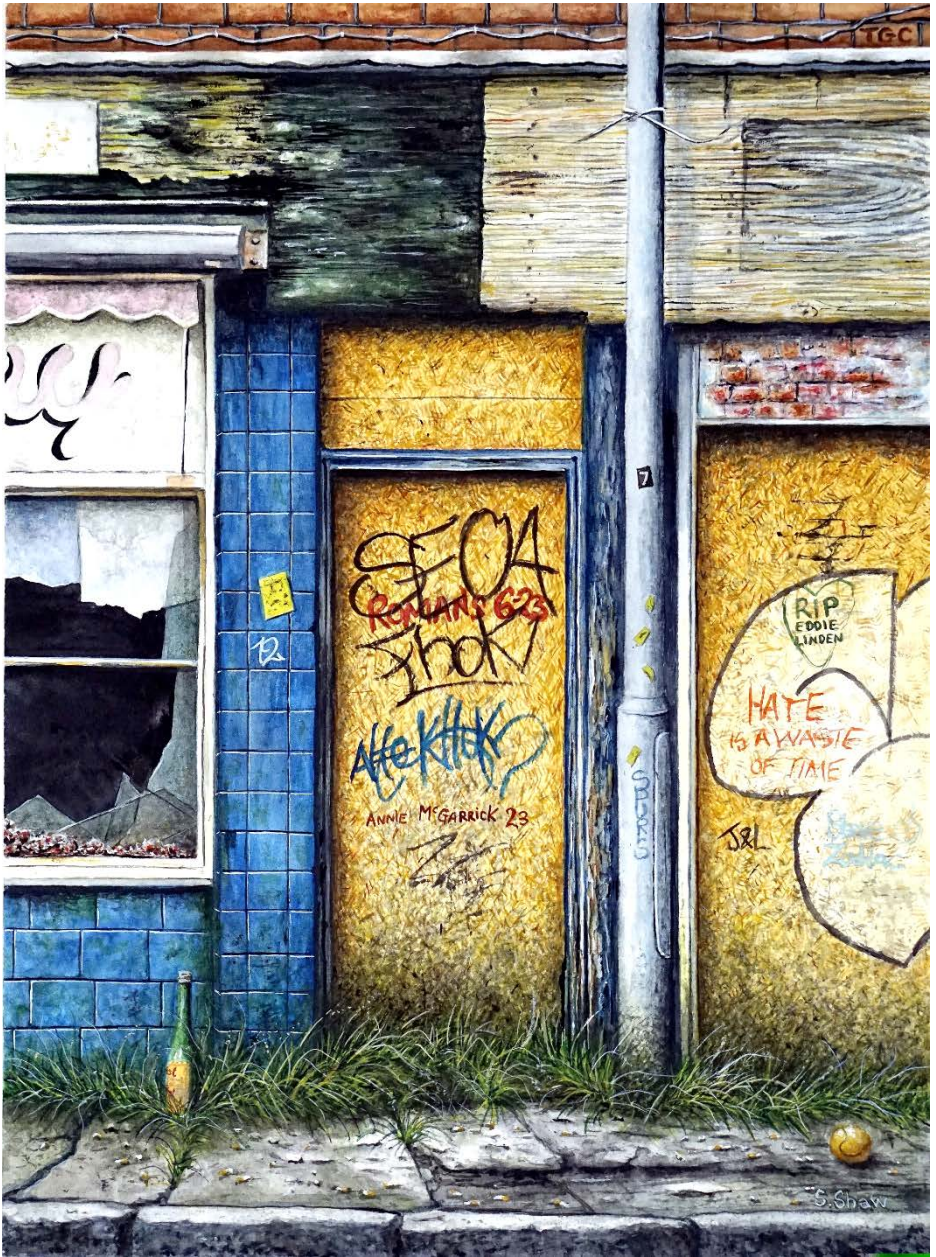
Urban Abstract 2, Watercolour on Paper, 38 x 28 cms