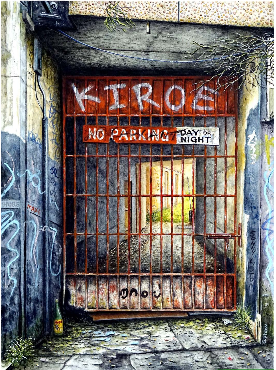
Move Along, Nothing to See Here, Watercolour on Paper, 38 x 28 cms