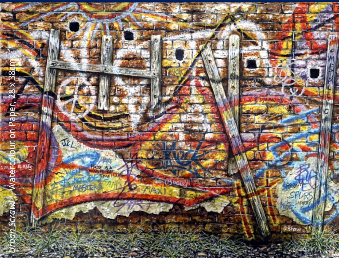
Urban Scrawl 1, Watercolour on Paper, 28 x 38cm