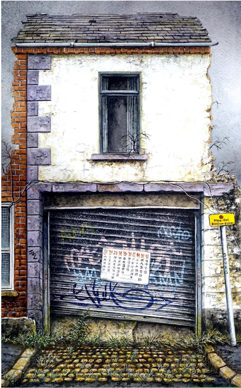
Last Man Standing , Watercolour on Paper, 37 x 23 cms