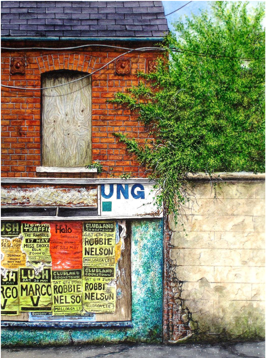
Urban Elements, Antrim, Watercolour on Paper, 38 x 28 cms