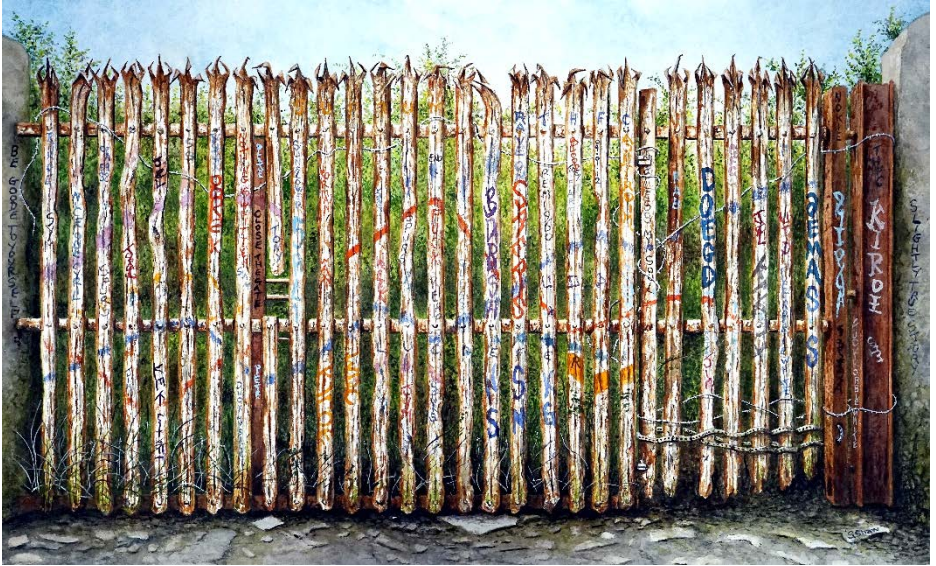
O'Fence , Watercolour on Paper, 29 x 48 cms