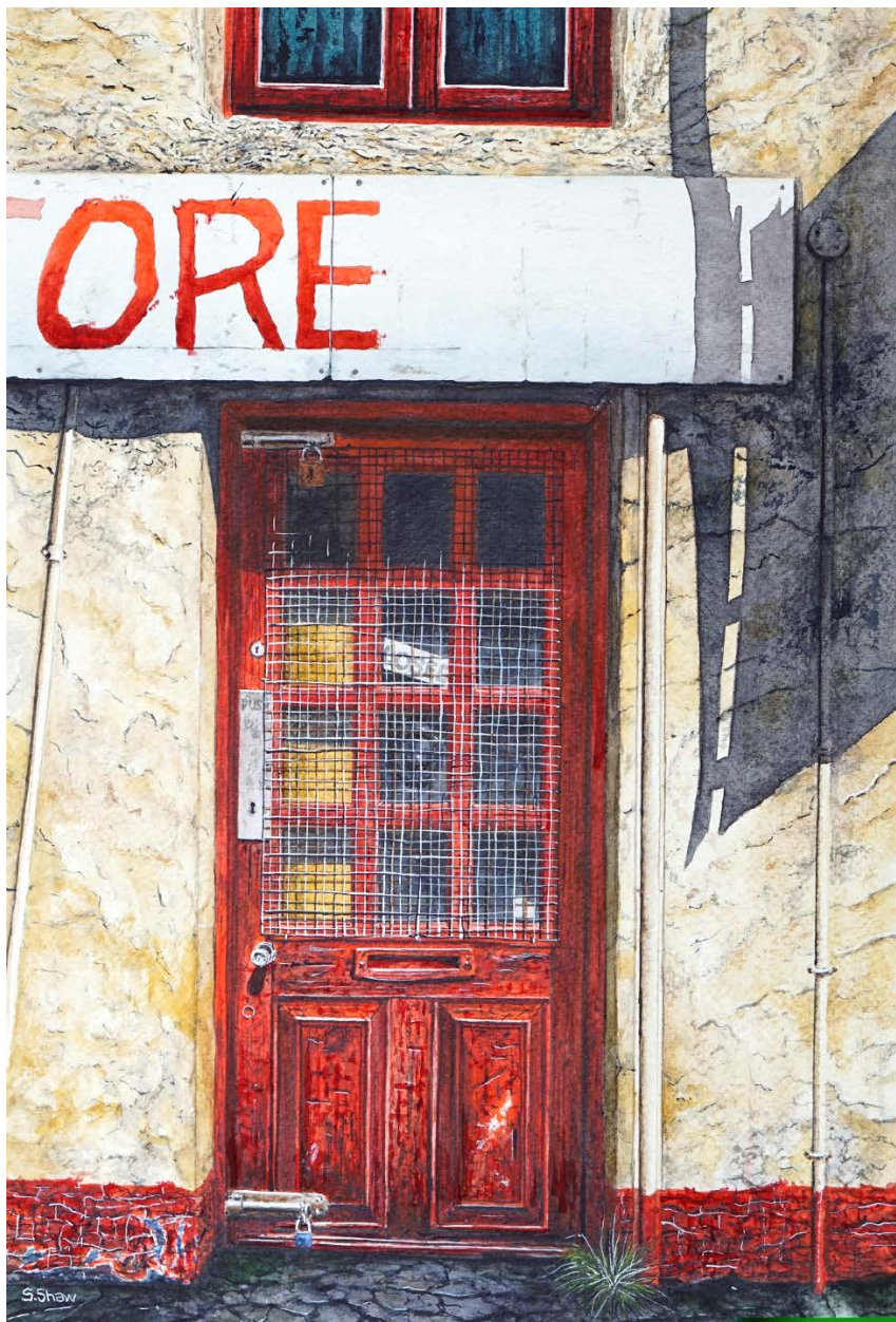
Gone (for Lunch) , Watercolour on Paper, 35 x 23 cms