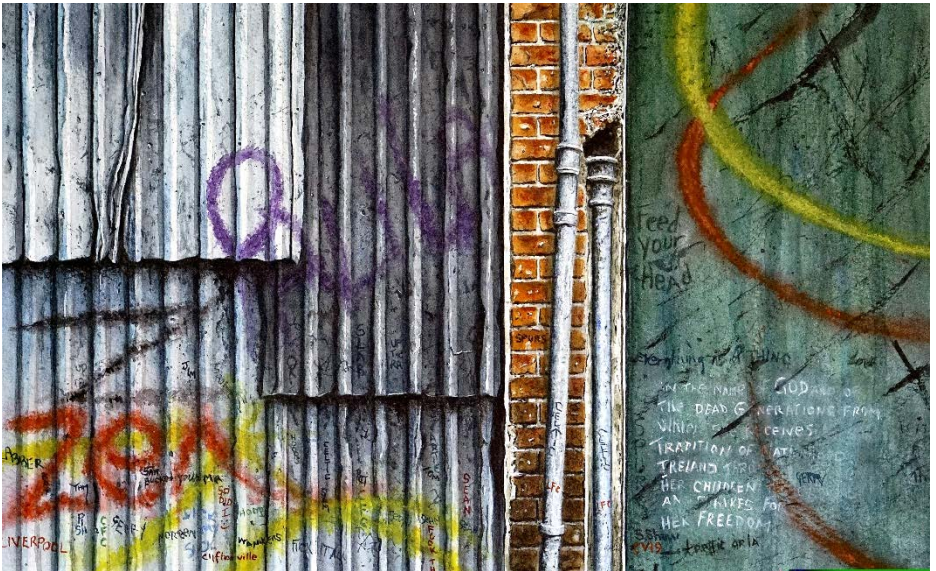
Declarations , Watercolour on Paper, 20 x 30 cms