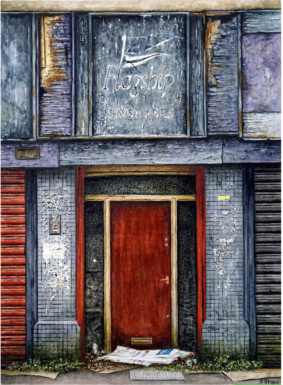
The Old Sweatshop , Watercolour on Paper, 38 x 28 cms