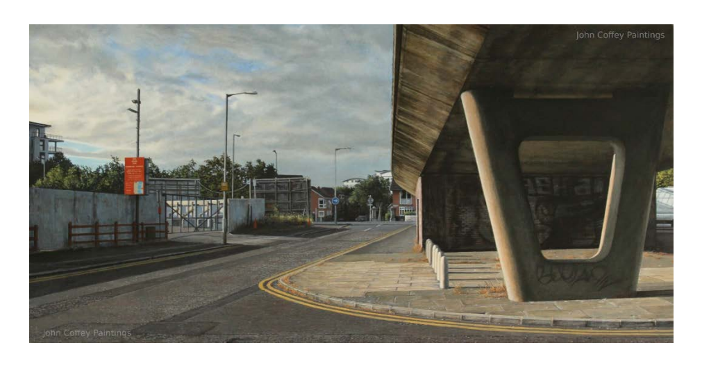
Station Road and Bridge End Flyover, Acrylic on Wood, 30 x 60 cm