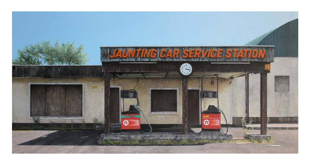
Jaunting Car Service Station, Acrylic on Wood, 30 x 60 cm