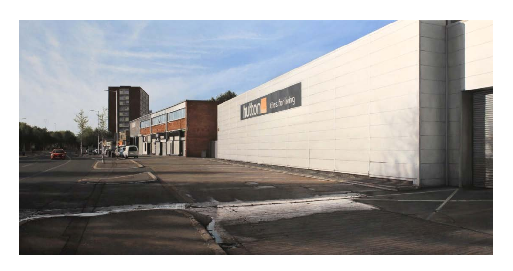
Retail Units and Tower Block, Shore Road, Belfast, Acrylic on Wood, 40.5 x 81 cm