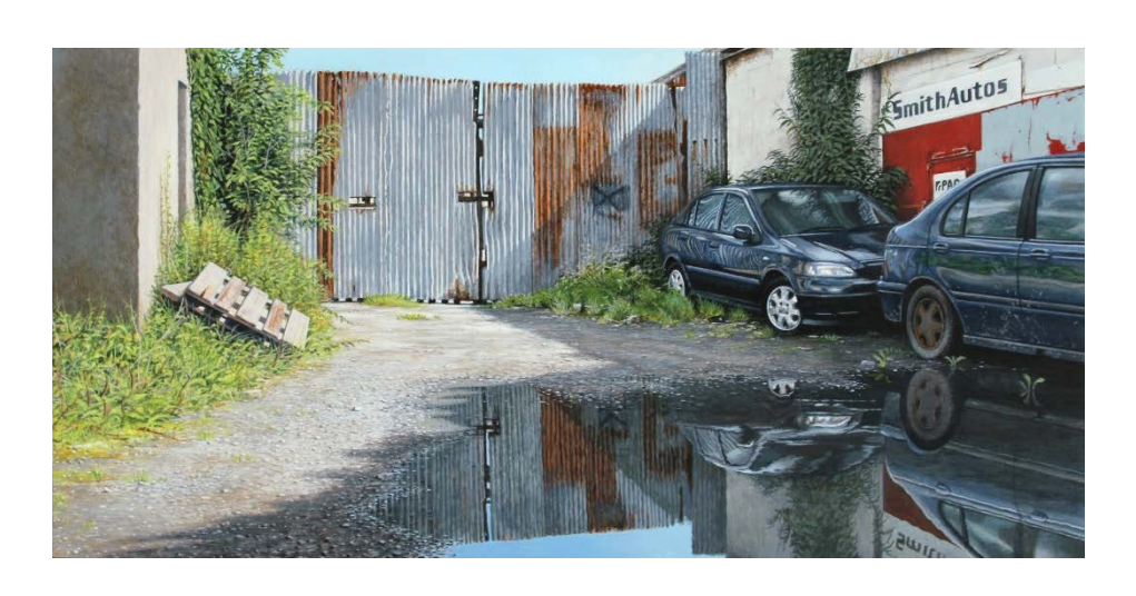
Smith Autos, Acrylic on Wood, 20 x 40.5 cm