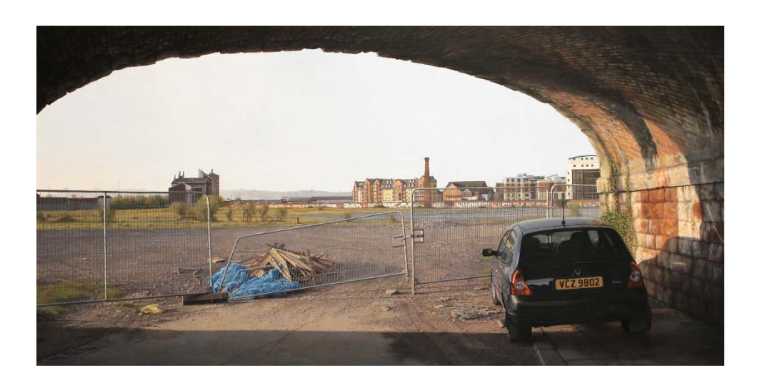
Sirocco Site, Belfast, Acrylic on Wood, 40.5 x 81 cm