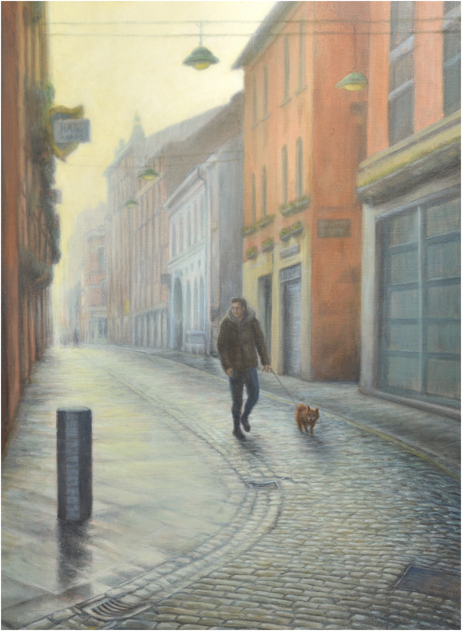
Walking the Man in Hill Street , Oil on Canvas, 55 x 45cms