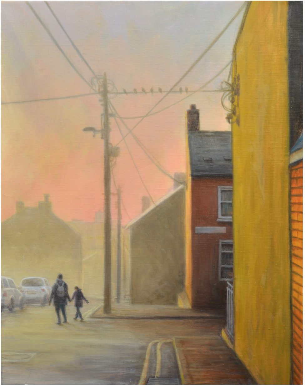
Early Morning Walk , Oil on Canvas, 55 x 43cms