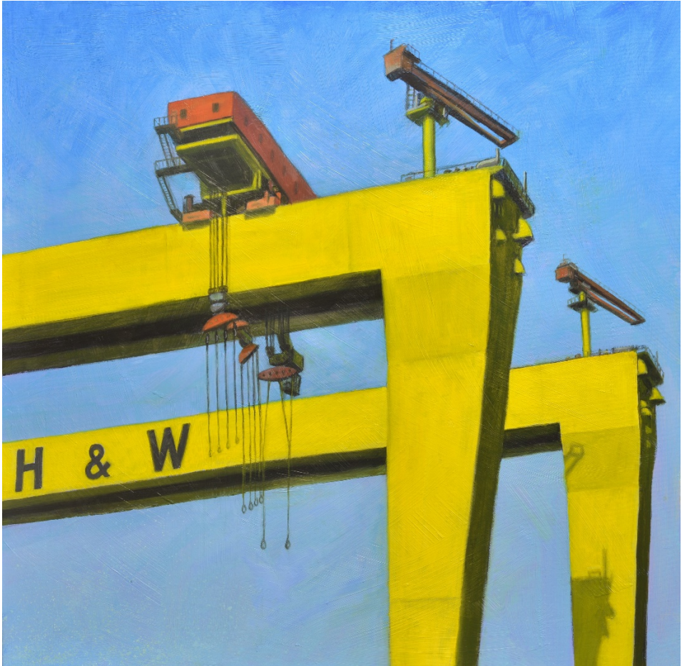
Two Brothers, Oil on Canvas, 65 x 65cms