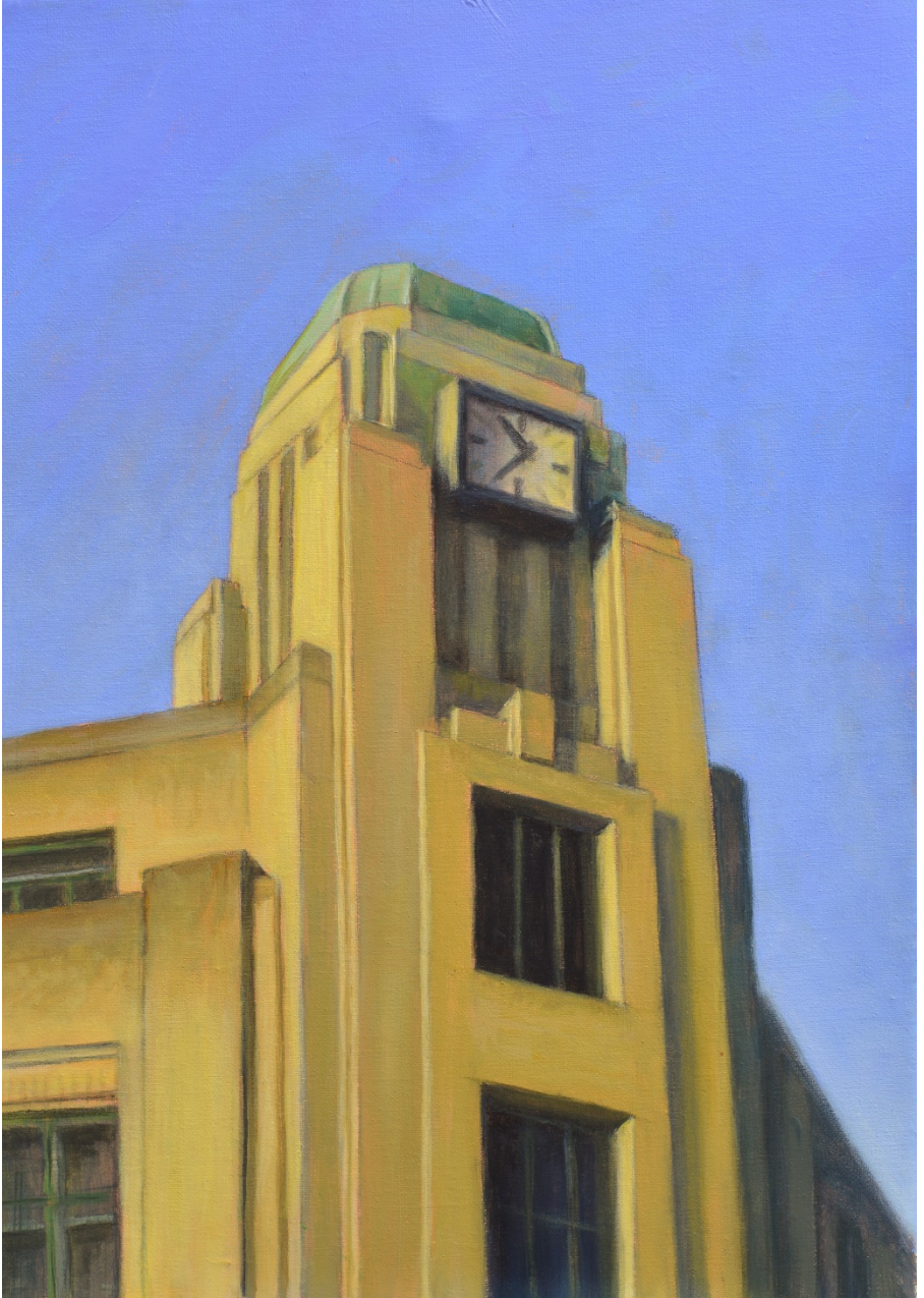
The Sphinx of Royal Avenue, Oil on Canvas, 38 x 28cms