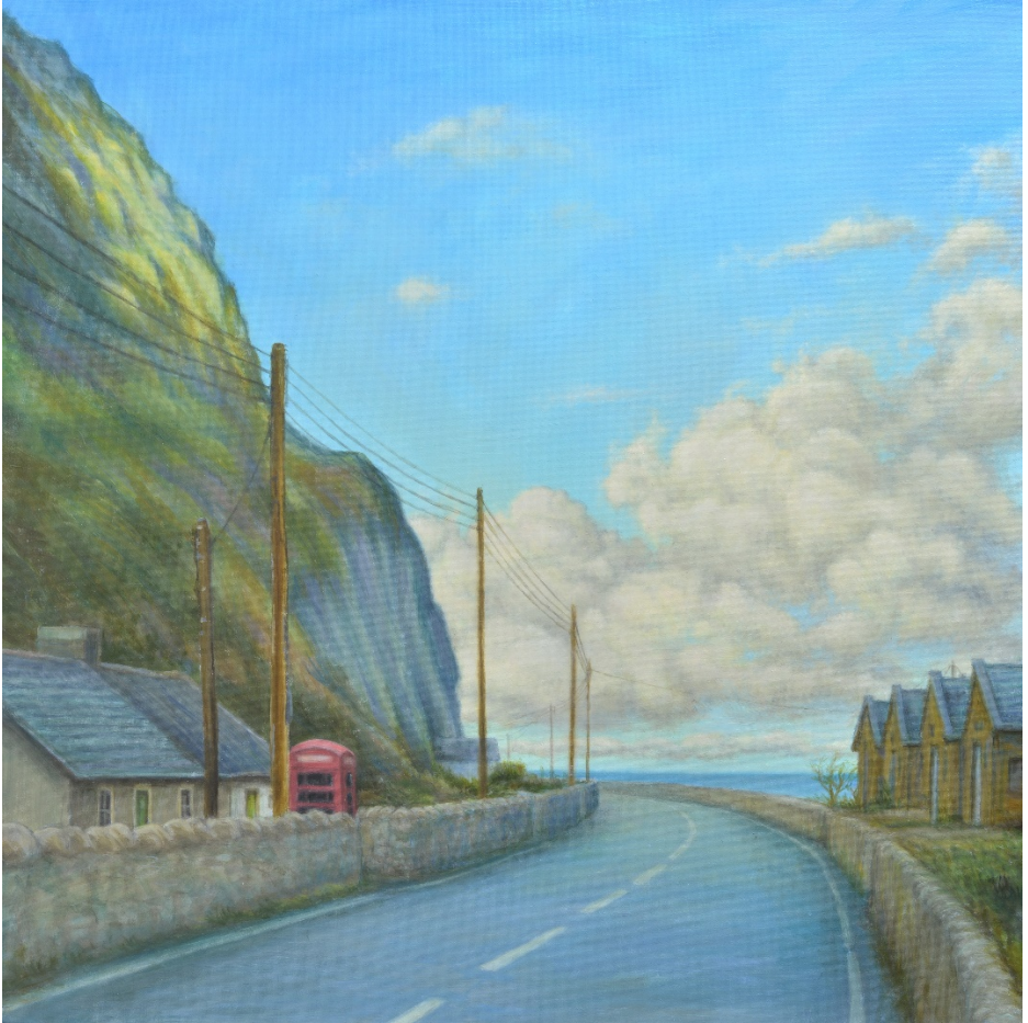
Escape from the City, Oil on Canvas, 64 x 64cms