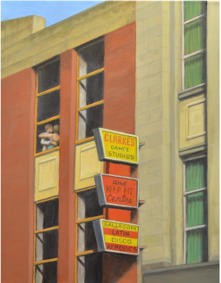
Dance Hall Days, Oil on Canvas, 50 x 38cms