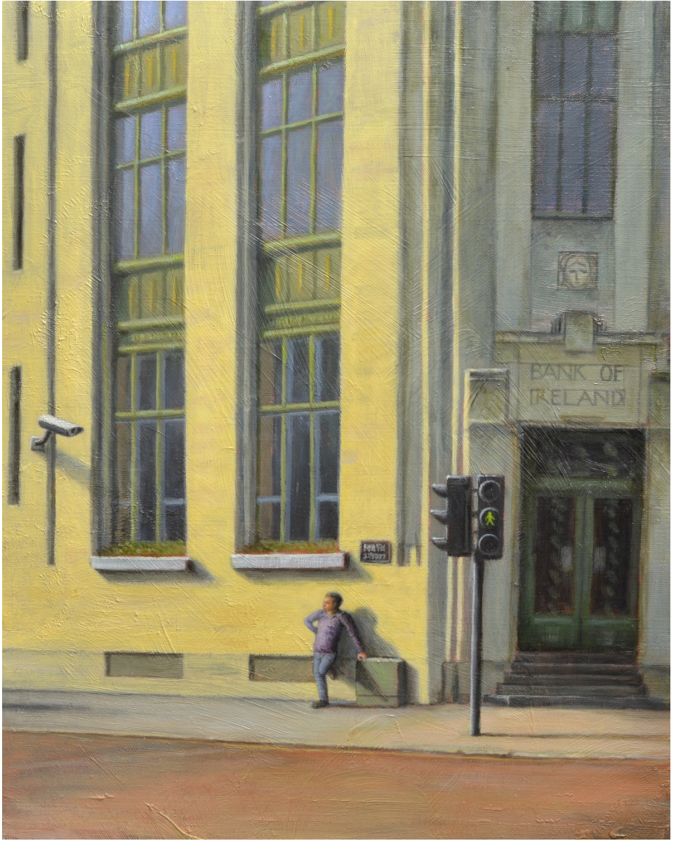
On the Sunny Side of the Street , Oil on Canvas, 55 x 45cms