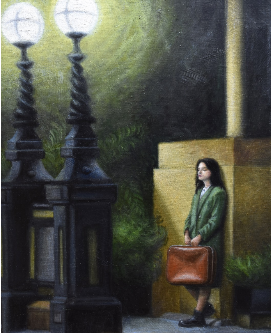
Waiting by the Train Station, Oil on Canvas, 55 x 45cms