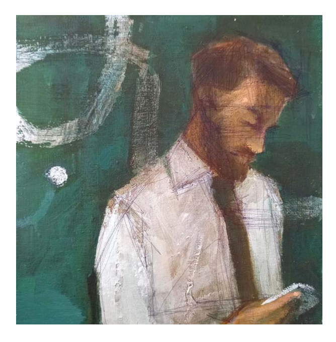
Scrolling, Mixed Media on Canvas, 25 x 25 cms