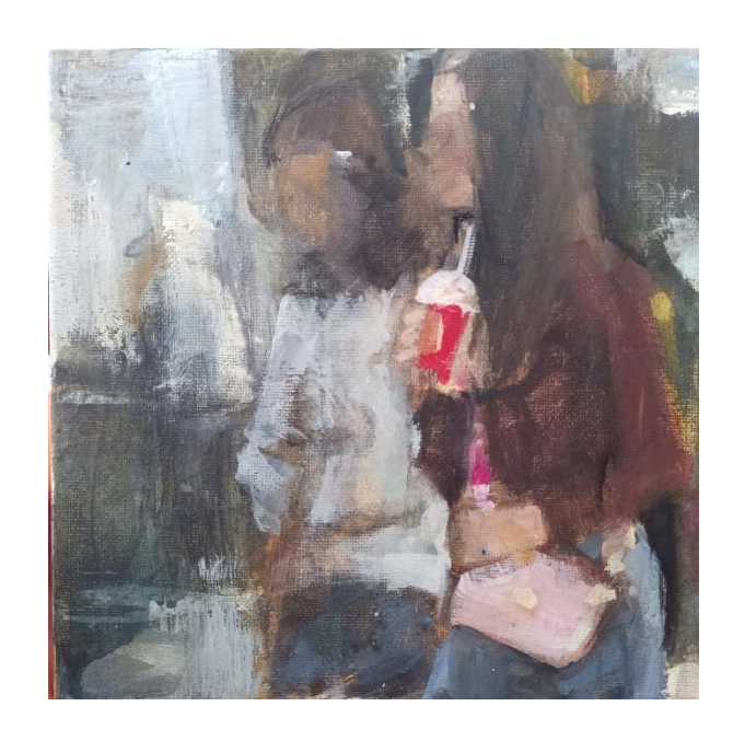
Saturday Afternoon, Mixed Media on Canvas, 25 x 25 cms