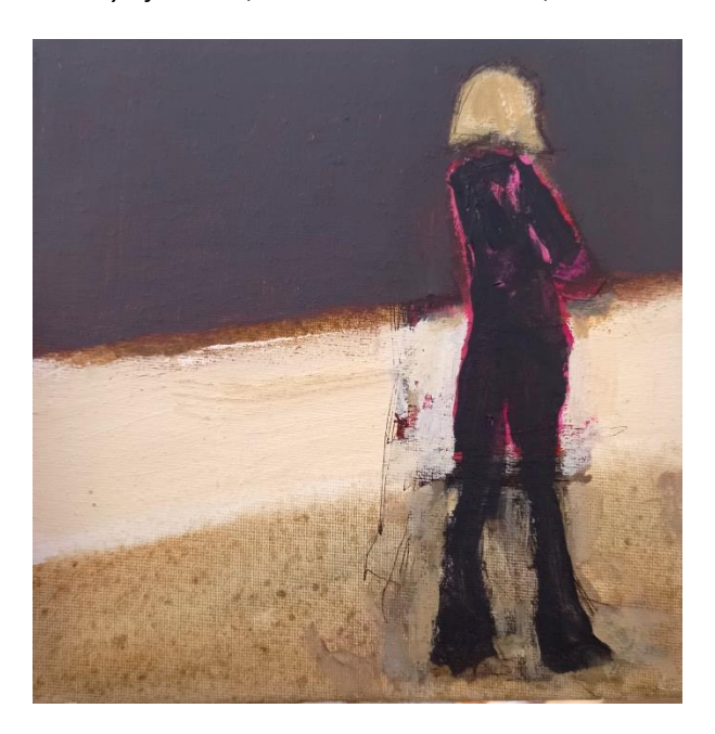
Winter Sun, Mixed Media on Canvas, 25 x 25 cms