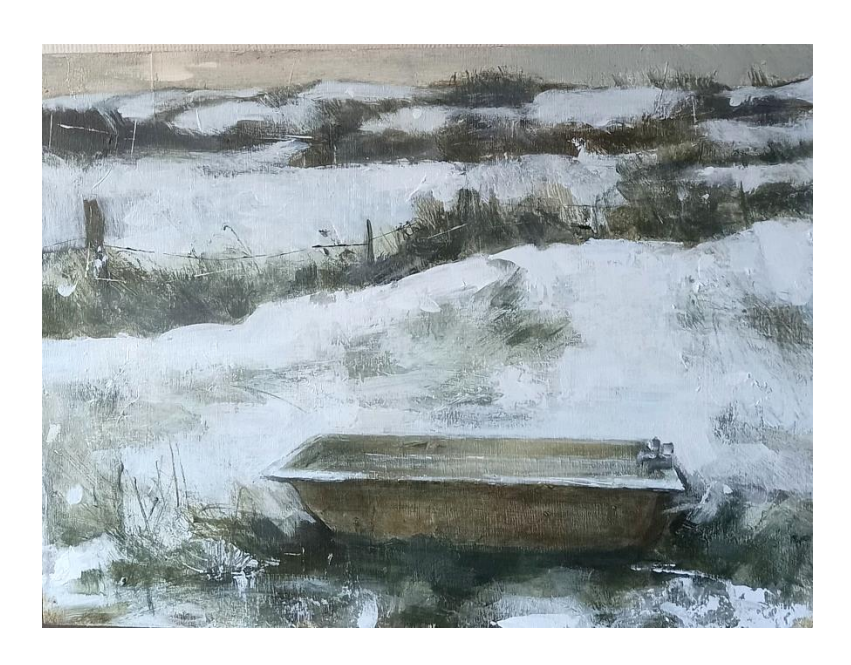
Winter Bathscape, Donegal, Mixed Media on Canvas, 40 x 50 cms