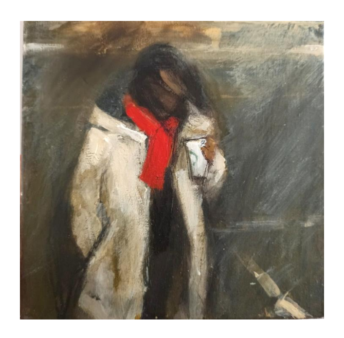
January Coffee, Mixed Media on Canvas, 25 x 25 cms