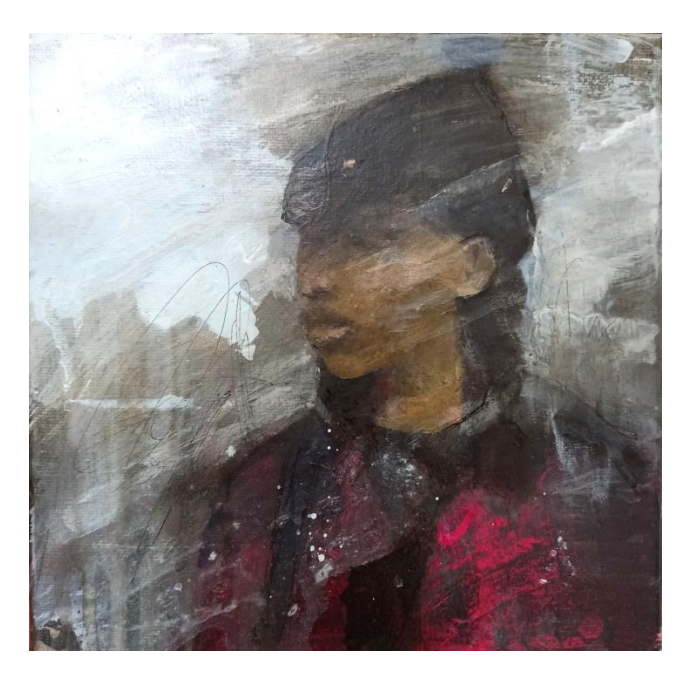
Through the Window, Mixed Media on Canvas, 25 x 25 cms