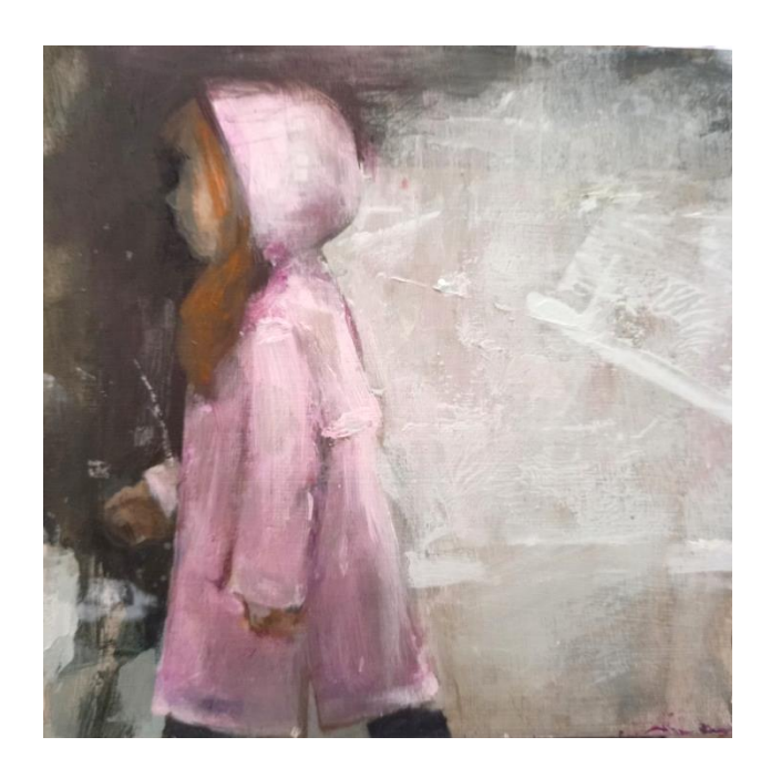
Pink Rain Coat, Mixed Media on Canvas, 25 x 25 cms