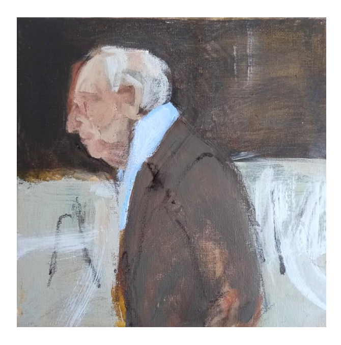
The Blue Scarf, Mixed Media on Canvas, 25 x 25 cms