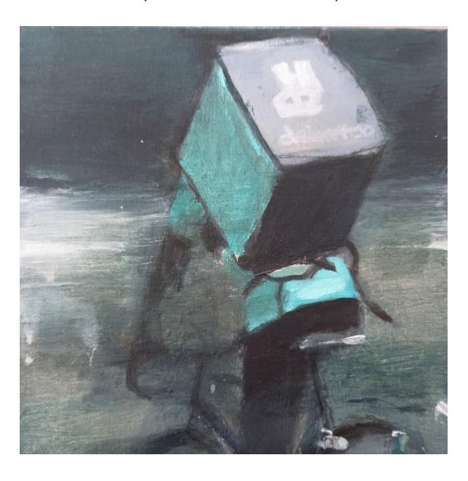
Night Rider, Mixed Media on Canvas, 25 x 25 cms