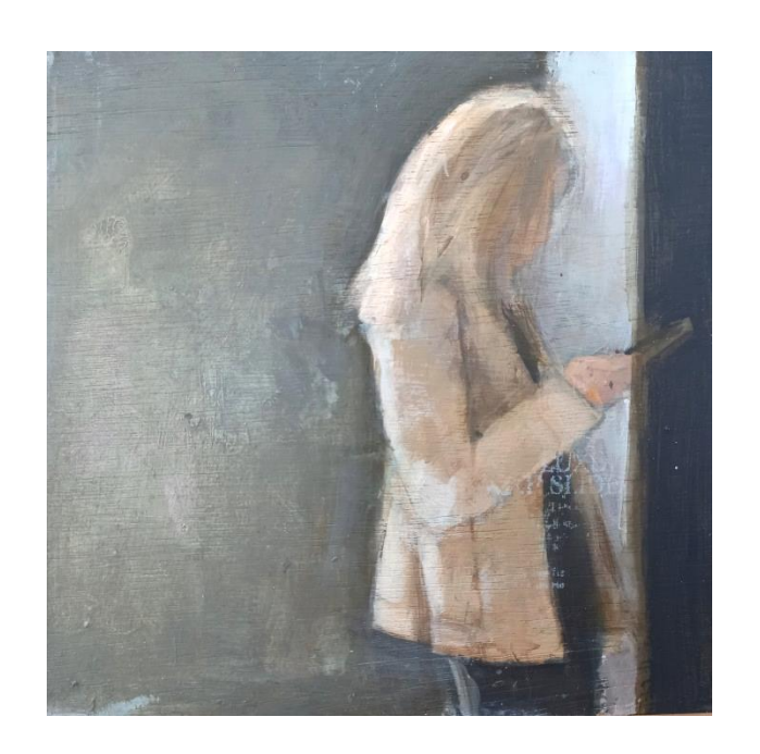
Texting, Mixed Media on Canvas, 25 x 25 cms