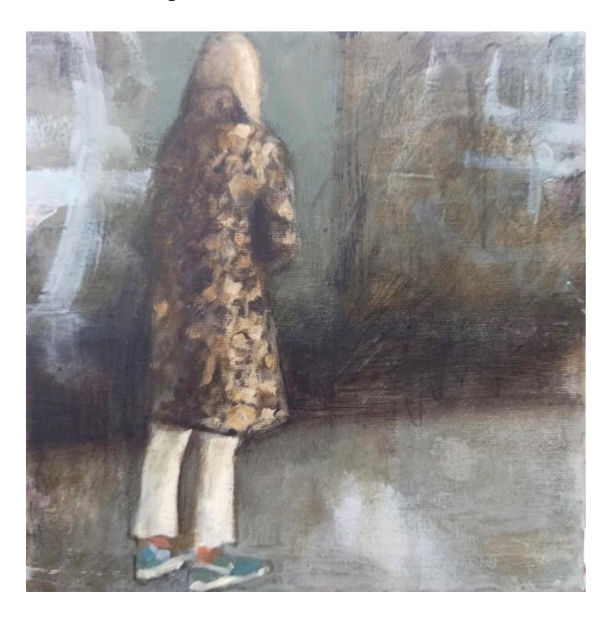
Waiting, Mixed Media on Canvas, 25 x 25 cms