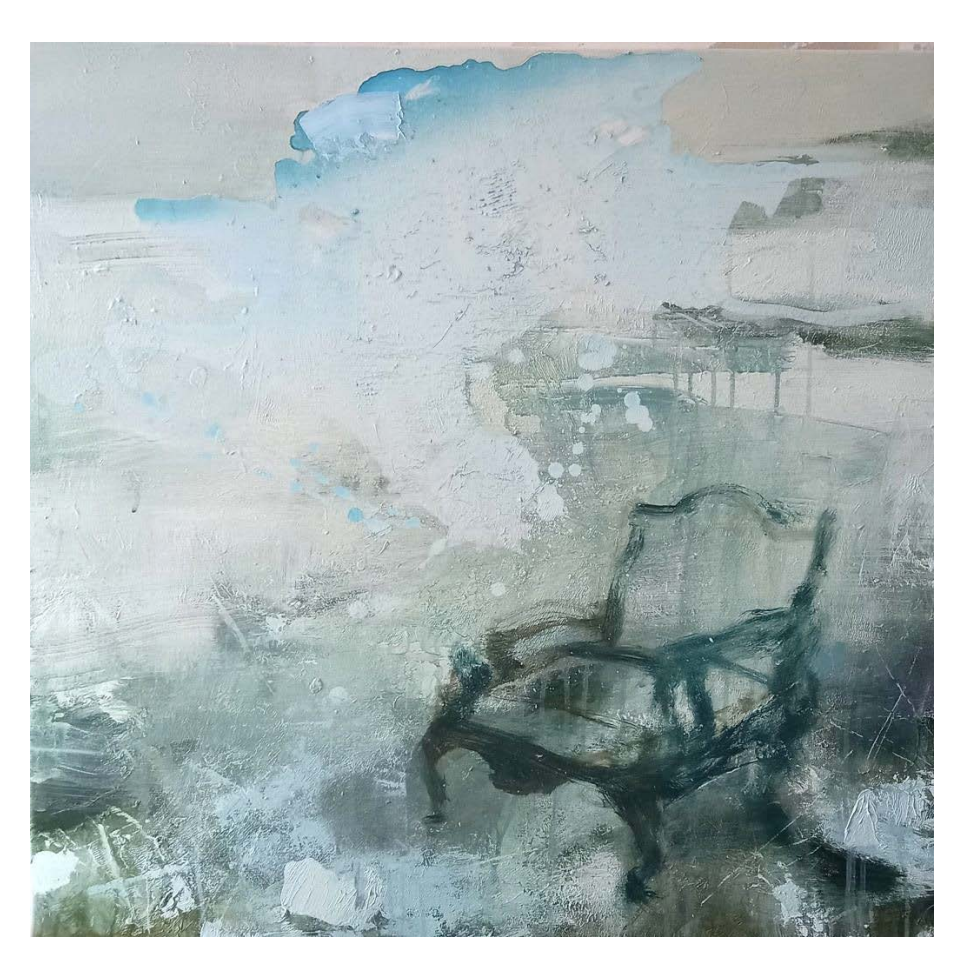
Things Left Behind, Mixed Media on Canvas, 90 x 90 cms