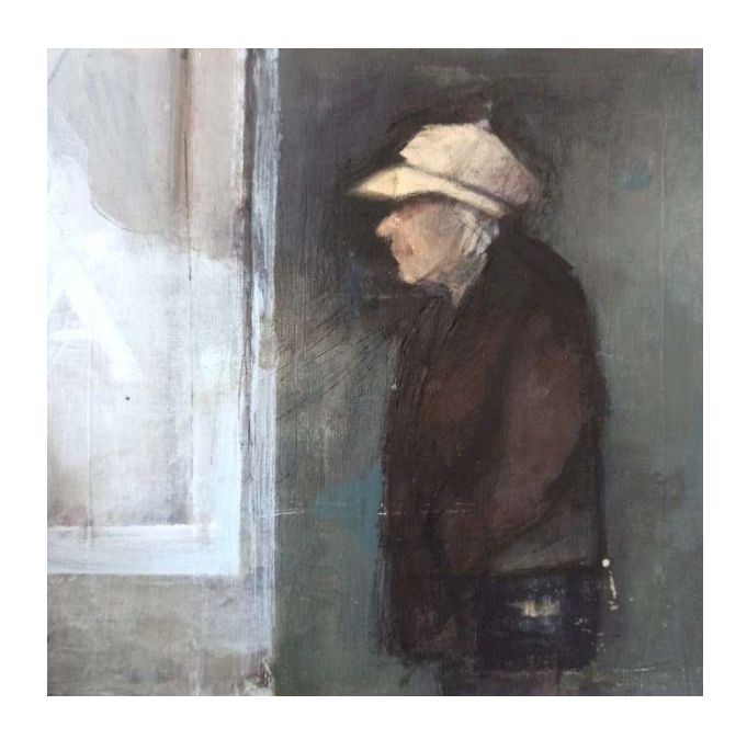
Bus Stop, Mixed Media on Canvas, 25 x 25 cms