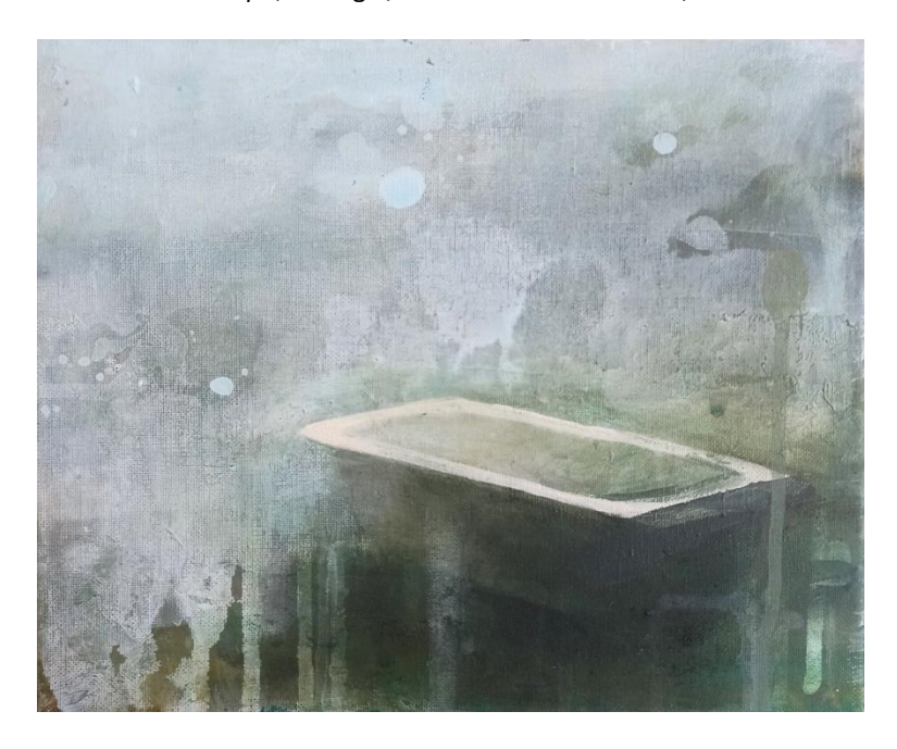
Bathscape Mist, Mixed Media on Canvas, 25 x 30 cms