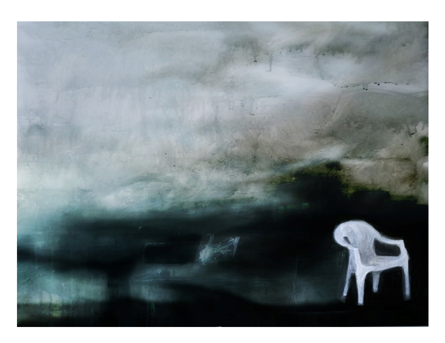
Night Journey, Mixed Media on Canvas, 25 x 25 cms