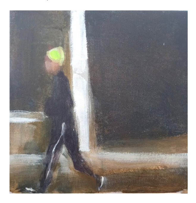
Jog, Mixed Media on Canvas, 25 x 25 cms