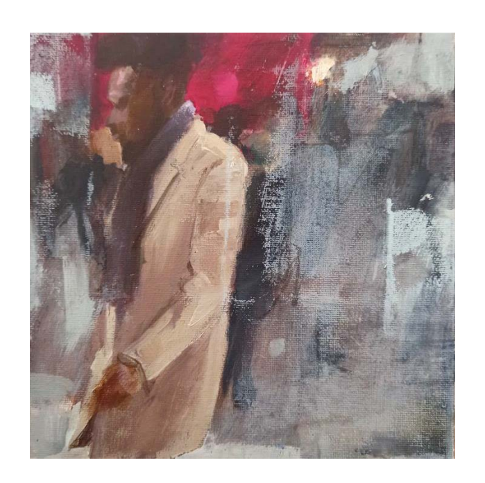
The Beige Coat, Mixed Media on Canvas, 25 x 25 cms