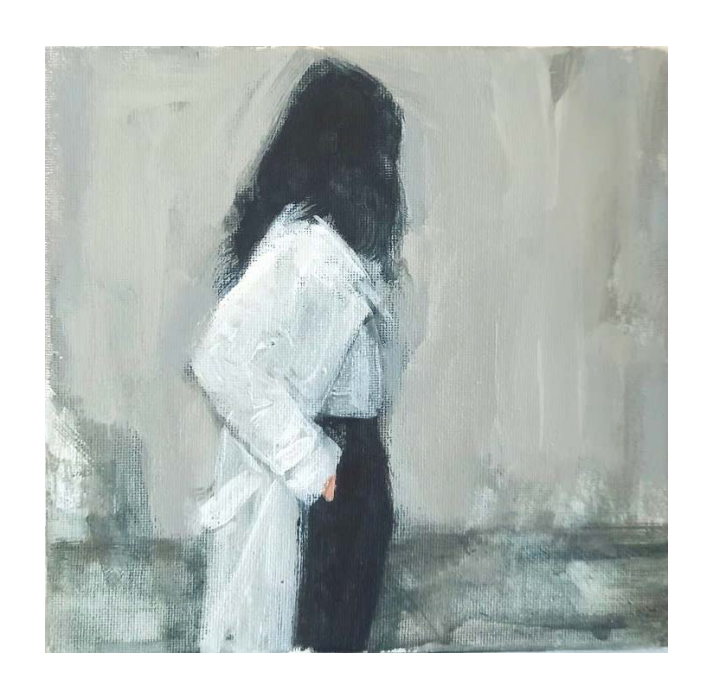
Wall Gazing, Mixed Media on Canvas, 25 x 25 cms