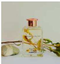
MEDITERRANEAN GARDEN 地中海花園

香調 前調：胡椒、荳蔻、檀香木 中調：皮革、沉香木、鳶尾花 基調：雪松、木質、琥珀、橡苔