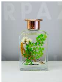
Solomon's Garden 所羅門花園