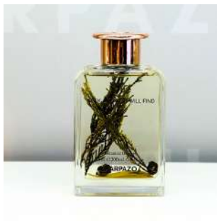
PROVENCE DE LAVENDER

Check out our popular scents.. A breeze of lavender, a zip of sweet wine, enjoy the scent of longjing green tea or the unforgettable mixed fresh sweetness & floral scent of the mountain.