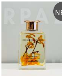
The Disappearing Fruit 消失的果子