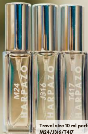
Travel size 10 ml perfume M24/J316/T417 SRP HKD128/bottle