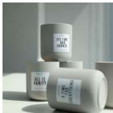
SCENTED CANDLE 香氛蠟燭