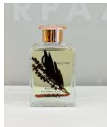
Forest Fig Tree 森林無花果樹