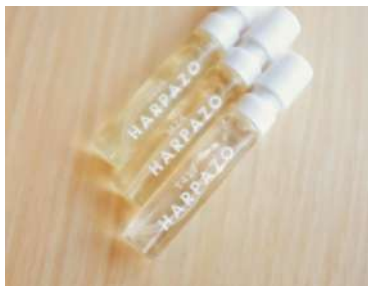
2 ml mini perfume 2毫升迷你香水 M24/J316/T417 SRP HKD99/3 scent 3種香味