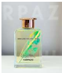
Jasmine Oolong 茉莉烏龍