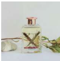
FOREST FIG TREE 森林無花果樹