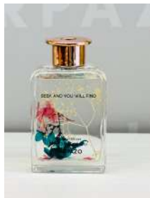
The Secret Words of Flowers 花之密語