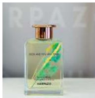
JASMINE OOLONG 茉莉烏龍