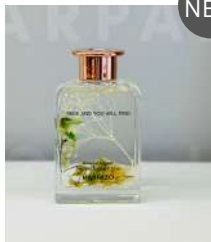
Love you to the Moon 愛你到月亮