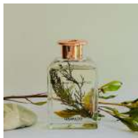
WESTLAKE LONGKONG 西湖龍井