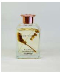
Mediterranean Garden 地中海花園