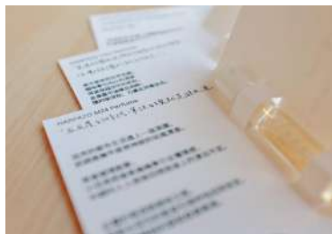
Travel size gift pack 旅行裝禮品包 2 ml mini perfume & 30g hand cream (choose your own fragrance combinations) 選擇您自己的香氛組合 RP HKD90/set