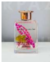
PROVENCE DE LAVENDER 普羅旺斯薰衣草