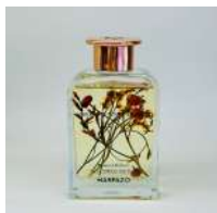
OSMANTHUS OOLONG 桂花烏龍