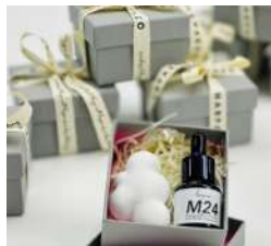
DIFFUSER OIL 香氛