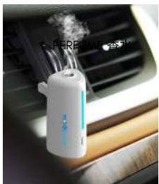
SMART SANITIZING CARE 智能消毒護理