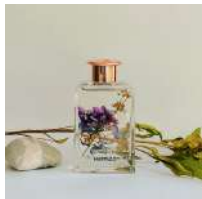
SECRET WORDS OF FLOWER 花之密語