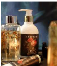
PERSONAL CARE 個人護理