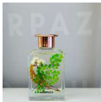
SOLOMON'S GARDEN 所羅門花園