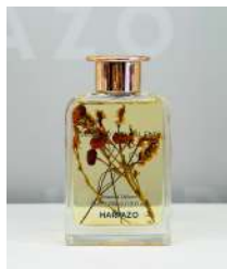
Osmanthus Oolong 桂花烏龍