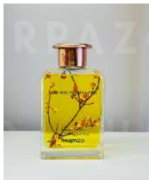
My Majesty 甜酒貴族