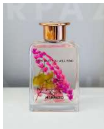
PROVENCE de Lavender 普羅旺斯薰衣草