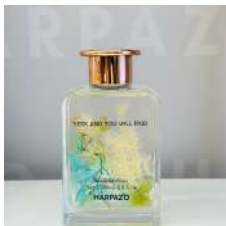
REED FRAGRANCE 藤枝香薰