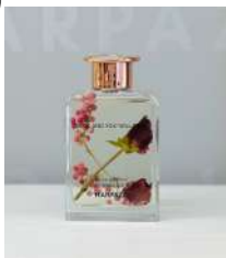
Sweet Rose Blossom 甜心玫瑰