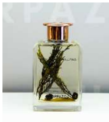
West Lake Longjing 西湖龍井