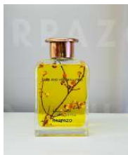
MY MAJESTY 甜酒貴族