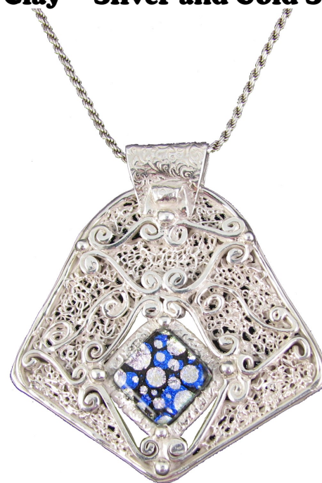
"Victorian Lace" Art Clay Silver and dichroic glass pendant by Katie Baum

Complete information and images for the Art Clay™ Silver and Gold Series