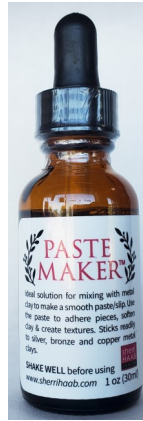
PasteMaker ACW #F-315