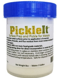
Pickling agent for removing firescale from fired bronze. ACW #KbD-001

Patination: Art Clay™ Bronze can be patinated multiple ways. Pieces can be painted with or dipped into a hot solution of Liver of Sulfur, then rinsed and polished for the desired amount of contrast. Patina can be added with heat, similarly to a heat patina on copper, though bronze is less heat tolerant so close attention must be paid while torching the piece.