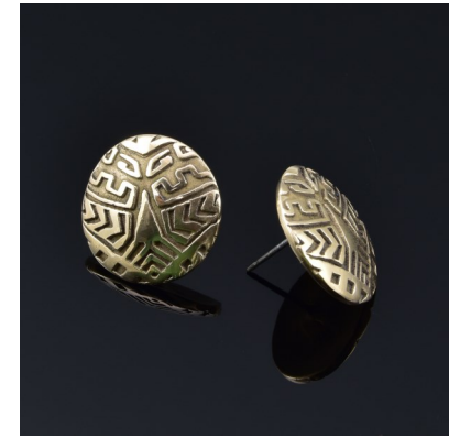
Art Clay Bronze Earrings with Titanium Posts by Art Clay Master Instructor Pam East

As part of the Art Clay™ family, you can be sure that all ingredients are non-toxic, and that the metals are 100% recycled and reclaimed. The formula has only 4 components: copper, tin, binder, and water. Of the metal portion, 90% is copper, and 10% is tin. Of the entire formula, 90% is metal, the remaining 10% is binder and water.