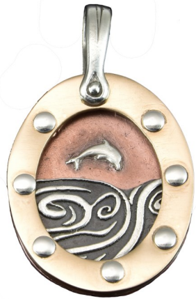
Art Clay Bronze, Silver, and Copper Shadowbox Pendant by Art Clay Master Instructor Pam East