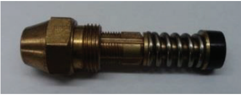
FUEL FILTER - TANK