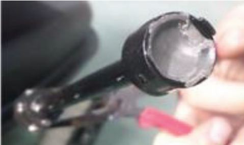
FUEL FILTER - TANK