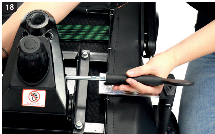
18 Place the handles on the tilt mechanism's axles. The rounded edge of the handles should point towards the front of the seat bottom.