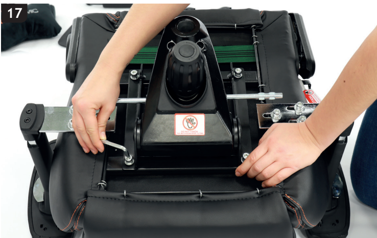
17 Once all screws are in place, tighten the screws firmly with the universal tool.