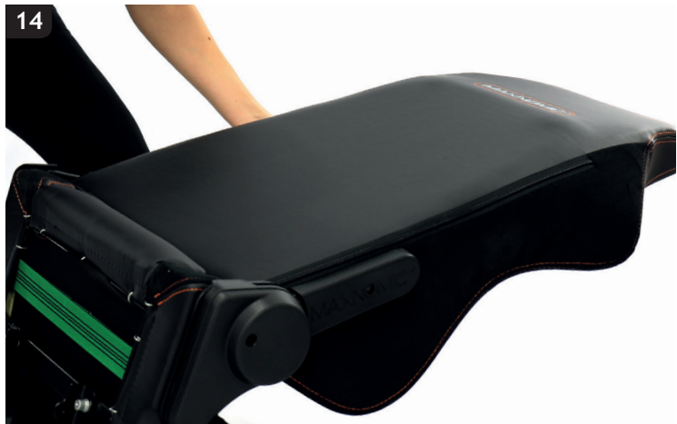
14 Turn the chair over so that the bottom of the seat is facing upwards.