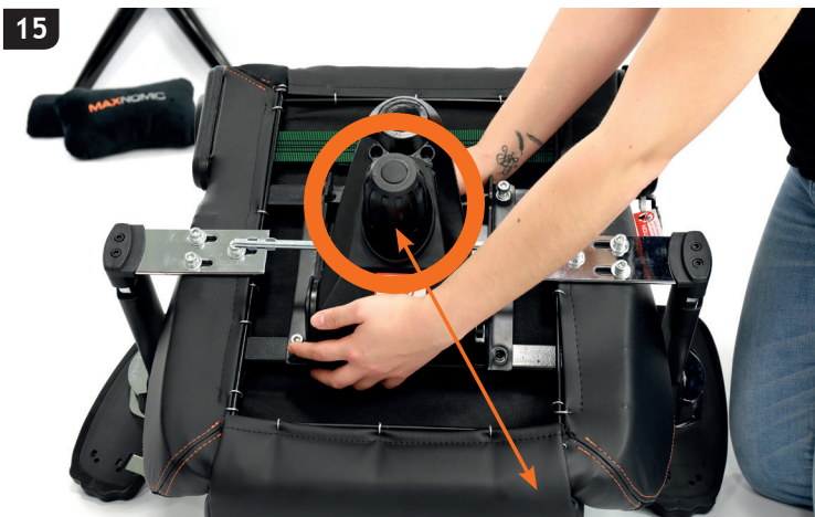
15 Now place the tilt mechanism over the screw holes as shown. The tilt mechanism knob should point towards the front edge of the seat bottom.