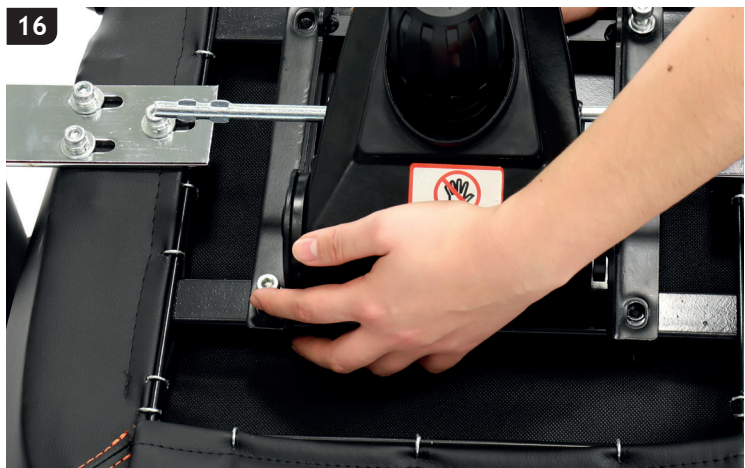
16 Loosely screw in the M8 screws provided by hand.