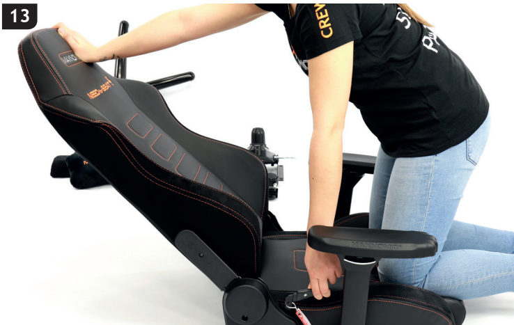
13 Adjust the backrest, by using the lever of the reclining mechanism, into it's back-most position.