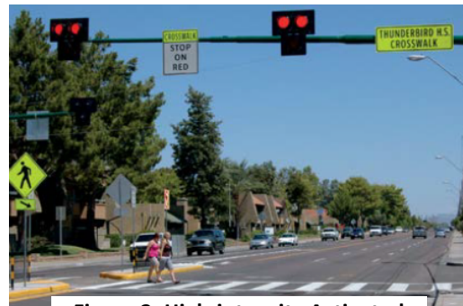
Figure 3: High-intensity Activated crosswalk (HAWK signal)

http://safety.fhwa.dot.gov/ped_bike/tools_solve/fhwasa14014/