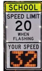
Figure 2: Speed feedback sign for a school zone.