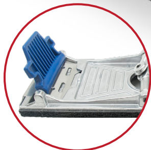
Quick-Change Locking Clamps