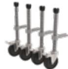
SET OF 4 CASTERS WITH LEVELING JACKS