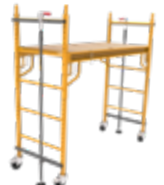
SCAFFLOCK™ SAFETY BRAKES