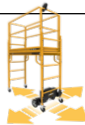
CLIMB-N-GO MOTORIZED SYSTEM