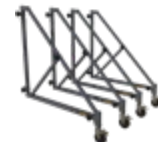
SET OF 46" OUTRIGGERS*