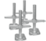
SET OF LEVELING JACKS