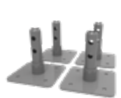
SET OF BASE PLATES