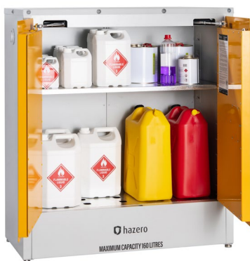
Hazero Flammable Cabinets – 160L

If you need a quality, reliable cabinet to suit your needs – indoors or outdoors, there's a Hazero cabinet for you.