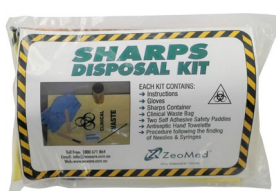
Sharps Kit 13-2003