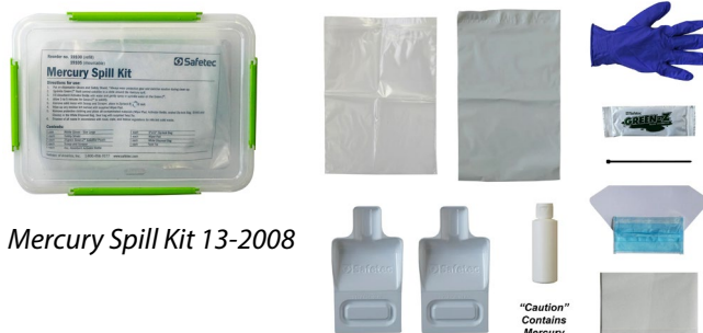
Mercury Spill Kit 13-2008