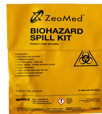
Biohazard Spill Kit 13-2001