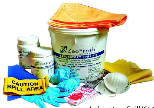
Laboratory Spill Kit 13-2002