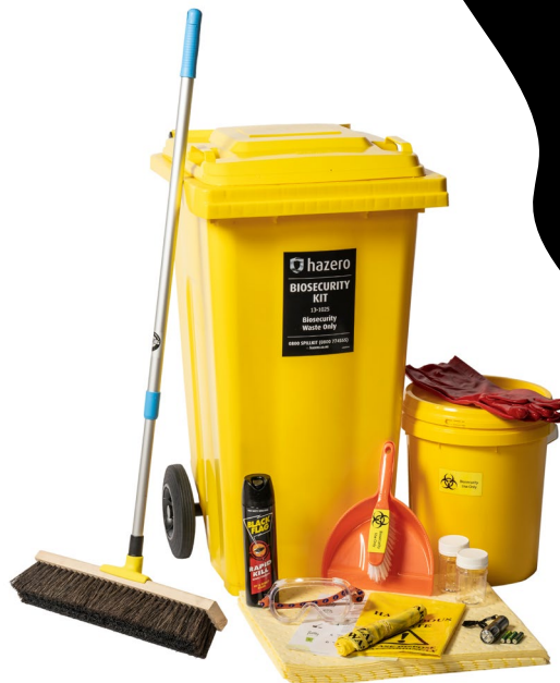
Hazero Biosecurity Kit 13-1025