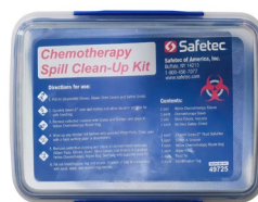
Cytotoxic Spill Kit 13-2011