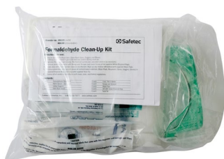
Formaldehyde Spill Kit 13-2012